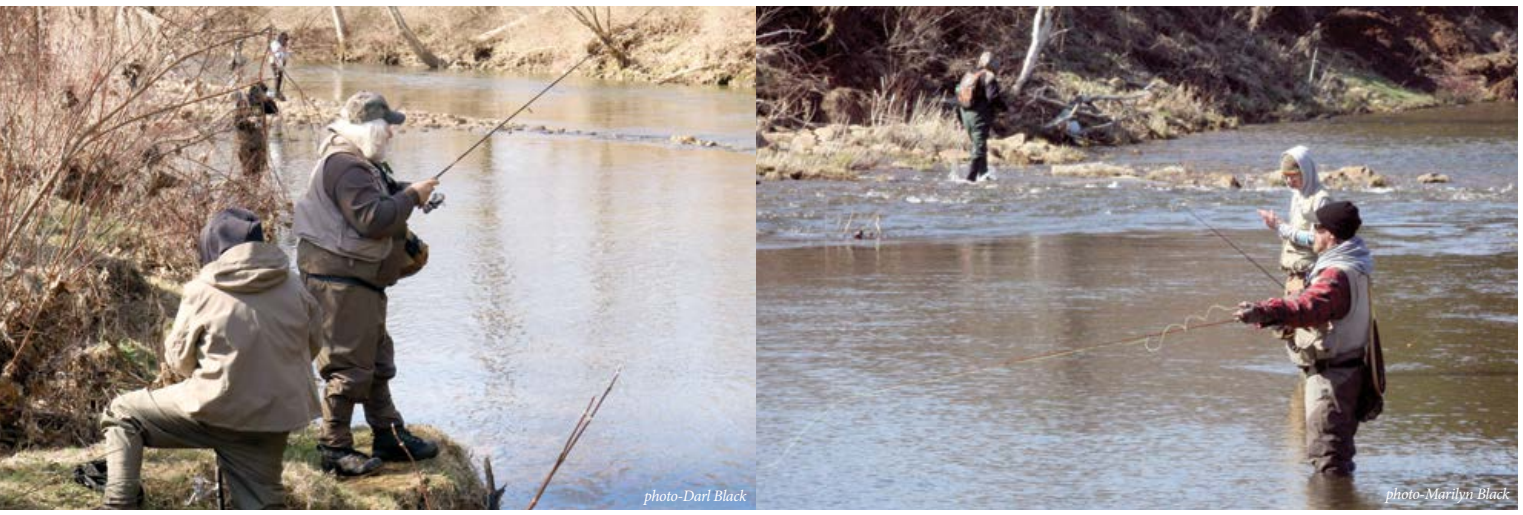
During the 2022 opening day of trout season, anglers of all ages fished from the Steiner property along Sugar Creek, Venango County.

"We will continue to seek partnerships to increase and improve long-term public access opportunities," said Hogan. To learn more about the VPA-HIP and other programs, visit fishandboat.com . □