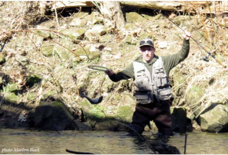
This fishing spot in the shadow of the Route 427 bridge will soon become a permanent Public Fishing Access corridor in the Voluntary Public Access-Habitat Incentive Program.

38 Pennsylvania Angler & Boater fishandboat.com