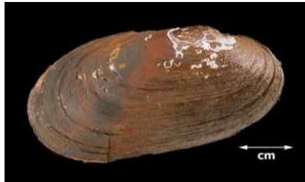
Salamander Mussel ( Simpsonaias ambigua ): Photo credit: Karen Little, Illinois State Museum.

Mussel in the Commonwealth, to ensure sufficient distribution,