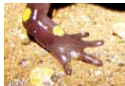
salamander front foot

Are lizards and salamanders the same? Not quite. Although the untrained eye commonly confuses adult lizards and salamanders, they are very different.