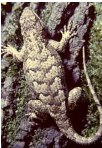
Eastern Fence Lizard