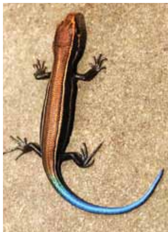
Northern Coal Skink (juvenile)

Is a lizard a skink or is a skink a lizard? The truth is that a skink is a type of lizard. However, they differ in a few ways.