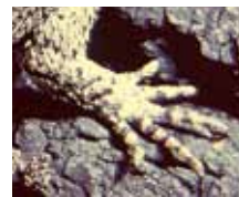
lizard front foot