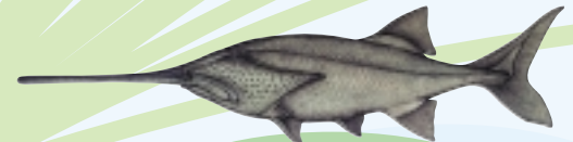
Family: Polyodontidae (paddlefish)