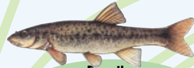
Family: Cyprinidae (minnows)