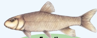
Family: Catostomidae (suckers)