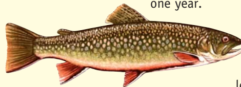
PA's State Fish—Brook Trout