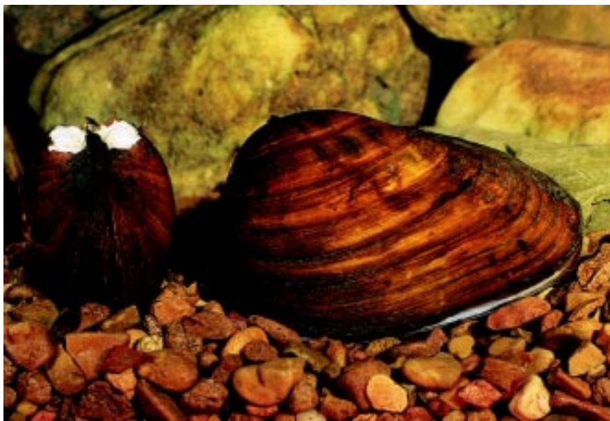
The clubshell mussel (above) and the riffleshell mussel are the two mussel species endangered in Pennsylvania.

Candidate species are those that may not be on the "sick list" yet, but have suspicious "symptoms" that require watchfulness and caution. There are bag and possession limits that restrict or prohibit their taking. For example, the timber rattlesnake is a candidate species that has about a month-and-a-half-long season and the annual possession limit is one (except for regulated hunts, which require special permits). The Commission urges anyone who catches a candidate species to release it "immediately and unharmed to the waters or other area from which it was taken."