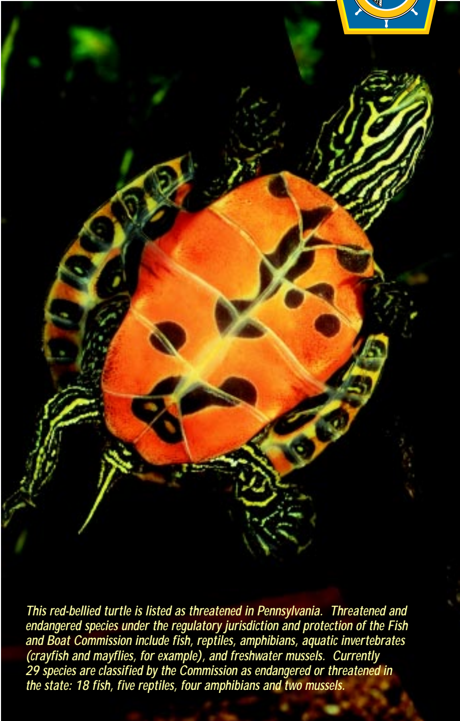
This red-bellied turtle is listed as threatened in Pennsylvania. Threatened and endangered species under the regulatory jurisdiction and protection of the Fish and Boat Commission include fish, reptiles, amphibians, aquatic invertebrates (crayfish and mayflies, for example), and freshwater mussels. Currently 29 species are classified by the Commission as endangered or threatened in the state: 18 fish, five reptiles, four amphibians and two mussels.

“Say the word ‘endangered species’ and people immediately think of ‘bald eagle.’ If we could get them also to think ‘bog turtle,’ then we’d be doing something.”