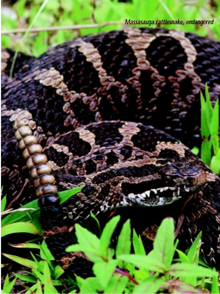
Massasauga rattlesnake, endangered

and that we'll soon have more hard facts about their status. He suspects that some aquatic insect species may be found only in one or two waters in the state. The Fish and Boat Commission works closely with the Wild Resource Conservation Fund, known to most Pennsylvanians as the state income tax check-off (donate your refund) and the "owl" vehicle license plate ("Conserve Natural Resources").