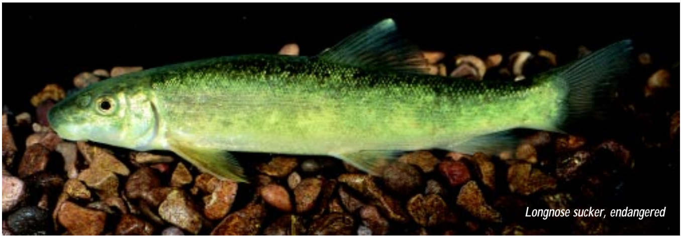
Longnose sucker, endangered

(reptiles and amphibians) for the state.