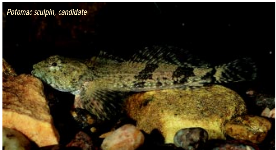
Potomac sculpin, candidate

instead of in summer, when they're active on the surface.