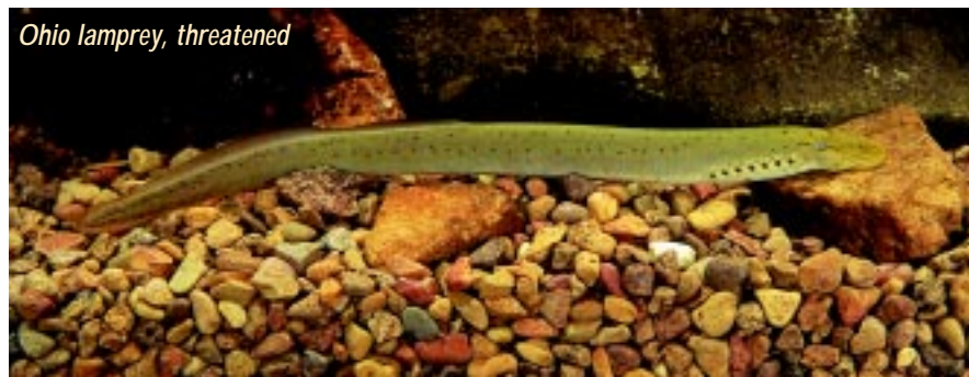
Ohio lamprey, threatened