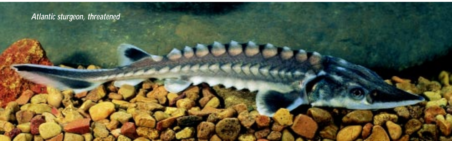
Atlantic sturgeon, threatened

and/or 90 days in jail, fingerprinting, mug shots, the works. If you inadvertently capture an endangered species, say a rare darter in your minnow seine, release it immediately where you got it, and you're OK with the law.