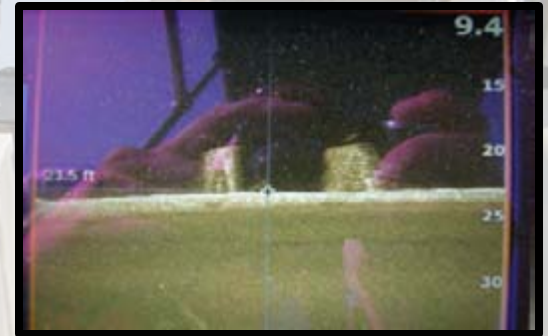
Submerged Porcupine Cribs as seen on Lowrance HDS Structure Scan.