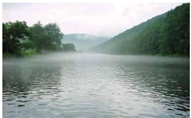
West Branch Delaware River

The protection and management of the West Branch Delaware and Delaware rivers face many challenges. Forest cover dominates an estimated 55 percent of the basin landscape, 26 percent is in agricultural use and 15 percent