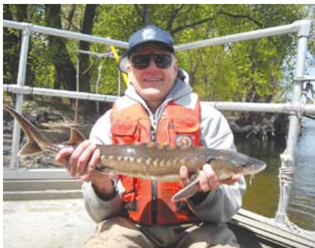
Shortnose Sturgeon-Pennsylvania endangered species

Smallmouth bass represent the single largest recreational fishery in the mainstem Delaware River. The PFBC annually monitors the smallmouth bass population. The bass population is typically well supported by multiple size and age classes; however, its abundance can fluctuate annually depending upon a variety of influences. These population fluctuations can, at times, be significant. Channel catfish and walleye are also popular sport fisheries. Long-term information pertaining to these populations is limited. The PFBC will continue to monitor the population of smallmouth bass and develop monitoring protocols for channel catfish and walleye populations. These programs will be adjusted, as necessary, to best measure the populations