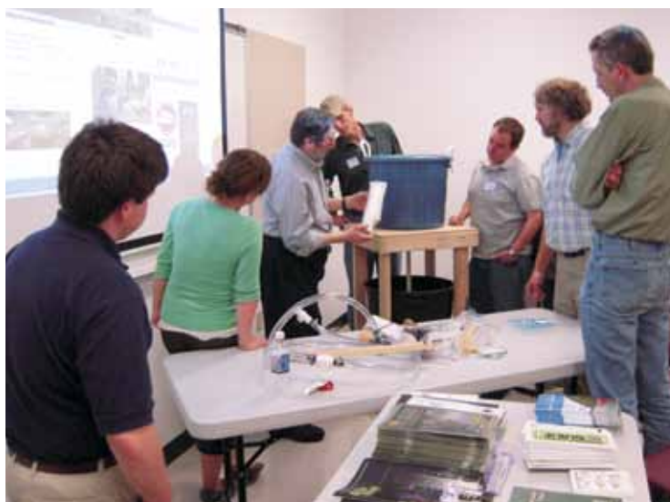
The Shad in Schools Program involves students in shad restoration and conservation efforts in the Delaware River and its tributaries.