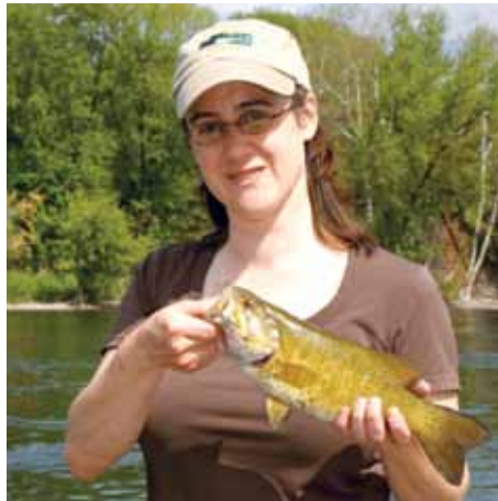
Delaware River smallmouth bass