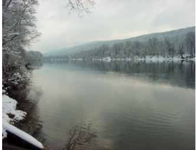
Smithfield Beach, Delaware River