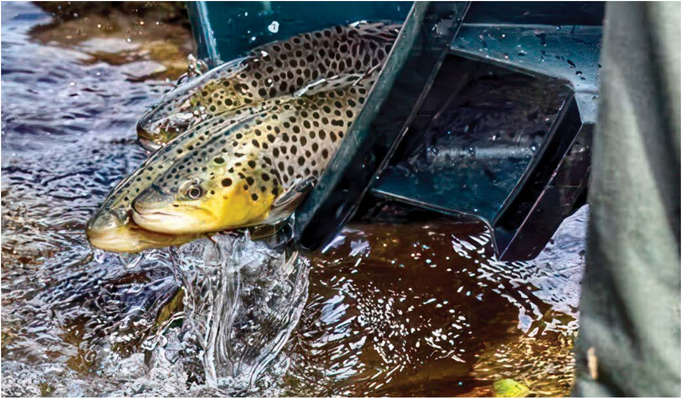
Stocking Brown Trout

In October, a unique family-friendly Punkin' Chunkin' Fall Festival takes place at Bald Eagle State Park.