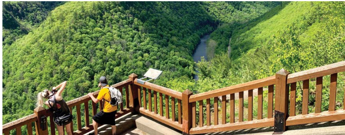
Pine Creek Gorge at Leonard Harrison State Park, Tioga County.

hop on your bicycle and ride to that perfectly secluded spot to fish. Primitive campgrounds, bathrooms and picnic areas are spaced along the trail.