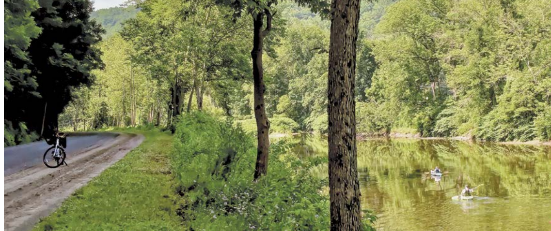
The Pine Creek Rail Trail runs between Wellsboro, Tioga County, and Jersey Shore, Lycoming County, and has great views of Pine Creek.