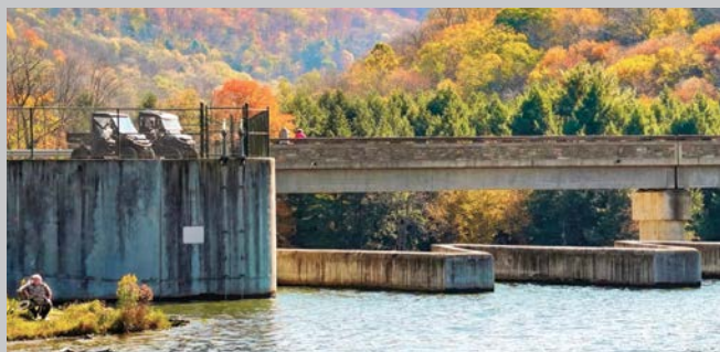
Lyman Run State Park, Potter County is a beautiful place for campers who want to combine fishing, boating and ATV trail riding.