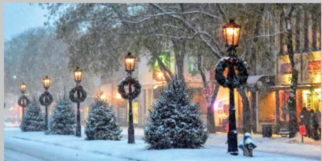
Wellsboro, near the northern trailhead of Pine Creek Rail Trail, is a quaint Norman Rockwell type town.