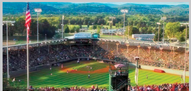
Williamsport, Lycoming County, hosts the Little League World Series every August.