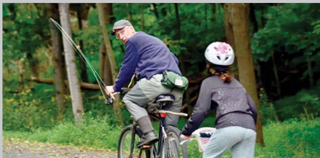
To travel farther on the Pine Creek Rail Trail, hop on your bicycle and ride to that perfectly secluded fishing spot.

Consider a stay at The Nature Inn, the park's lakeside hotel, voted the #1 eco-lodge in the nation. The inn often hosts educational and nature-related programs with a focus on sustainability and conservation.