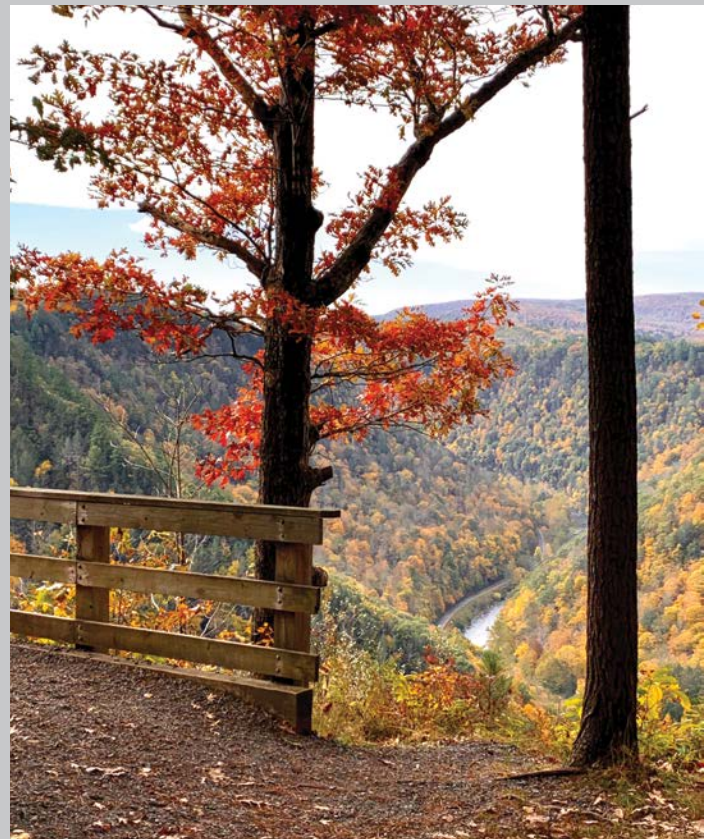
Pine Creek Gorge, Tioga County