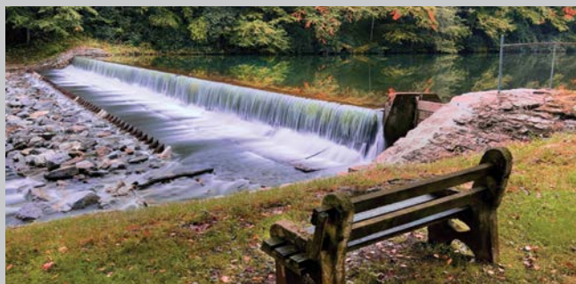
A view of the dam at Kettle Creek campgrounds, Kettle Creek State Park, Clinton County.