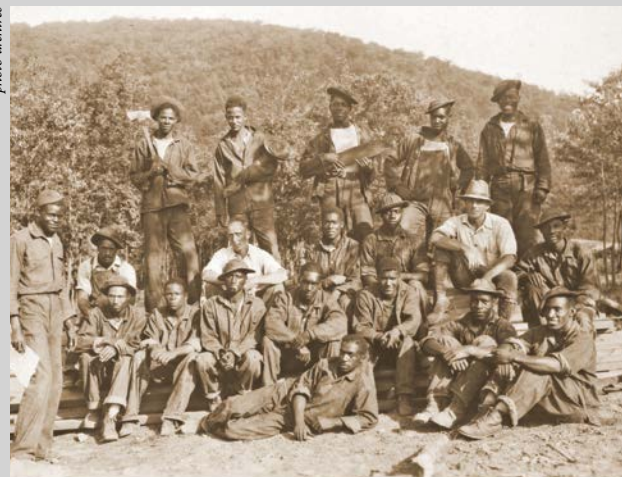
Roosevelt's Tree Army had a lasting impact on Pennsylvania including the improvement of water quality through the planting of trees.