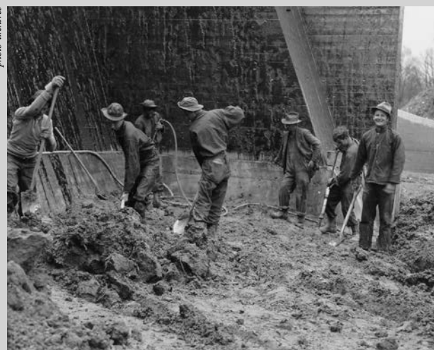
Members of a CCC crew work on the foundation of the dam that created Laurel Hill Lake at Laurel Hill State Park.