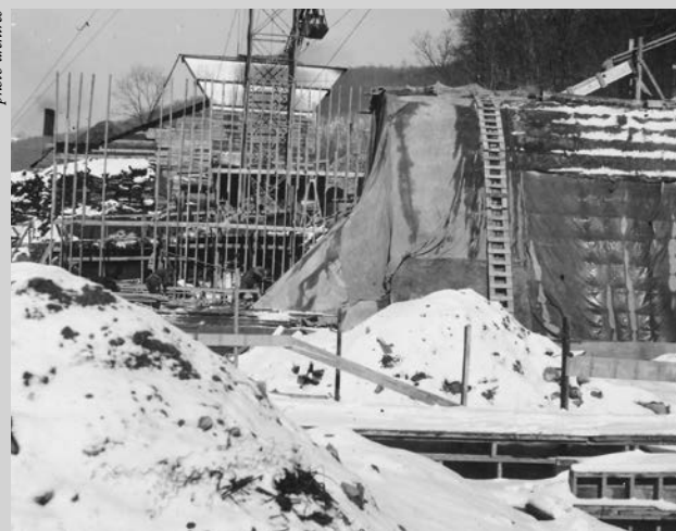
Construction of the Jones Mill Run Dam at Laurel Hill State Park, Somerset County.