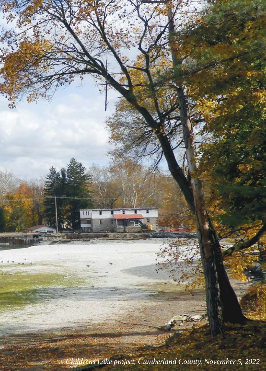
Childrens Lake project, Cumberland County, November 5, 2022