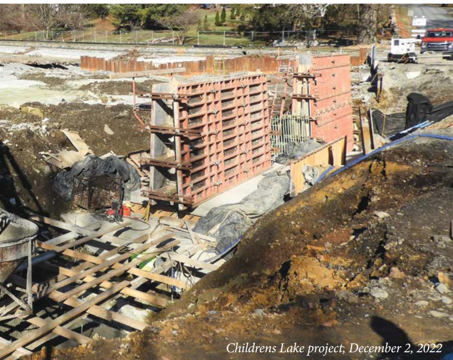
Childrens Lake project, December 2, 2022

Trail. The lake is owned by the Pennsylvania Fish and Boat Commission (PFBC), with the grounds around the lake leased to South Middleton Township and maintained by the Boiling Springs Civic Association.