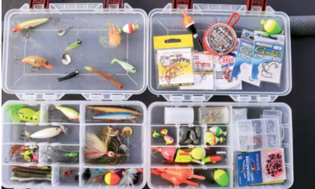
Minimize tackle when fishing from shore. In a small tackle case, bring classic lures for a variety of fish species. In another case, bring a variety of hooks, weights and floats.

bullheads, crappies and Walleyes; #2/0 hooks for big catfish and pike; and a few floating jig heads. Also, include splitshot, egg sinkers, swivels and several floats. Weighted bobbers and slip floats allow longer casts. Have a second tackle case with a limited selection of shallow-running artificial baits.