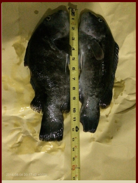
Left: Bucks County Turtles. Above: Tautog fish. Below: Jefferson Salamander and Timber Rattlesnake