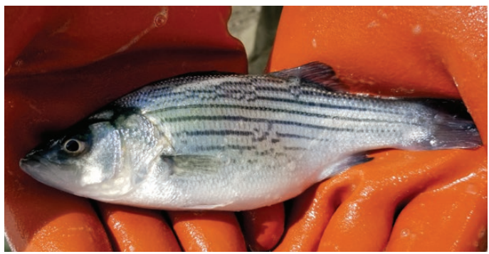
A hybrid Striped Bass at Gifford Pinchot State Park, York County.

In September, the PFBC stocked 2,000 hybrid Striped Bass into Pinchot Lake at Gifford Pinchot State Park, York County. This mix between a Striped Bass and White Bass are sterile, so the stocked fish will not reproduce and overpopulate the waters bass are stocked into. These fish are voracious feeders and grow quickly to lengths of 20 inches or more and provide great fishing opportunities.