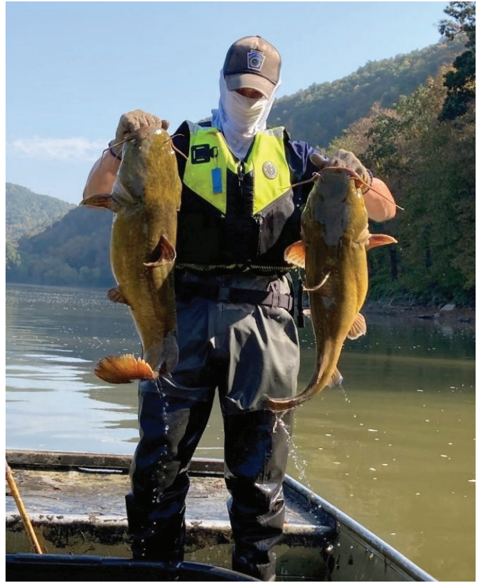
Flathead Catfish on the North Branch Susquehanna River.

In 2021, the PFBC surveys revealed further expansion of Flathead Catfish in the North Branch Susquehanna River. This large catfish species, native to the Ohio River basin, were first documented in the lower reaches of the Susquehanna River in the early 2000s, and first captured in the North Branch Susquehanna River by PFBC biologists in 2014. In 2014, Flathead Catfish were captured near Berwick, Columbia County, upstream to Kingston, Luzerne County. Sampling in 2020 conducted at West Falls, Wyoming County, documented an upstream population expansion of approximately 20 miles. Additional sampling in 2021 documented Flathead Catfish near Wysox, Bradford County, and Bloomsburg, Columbia County. Flathead Catfish have now been documented in 117 river miles of the North Branch Susquehanna River.