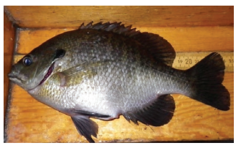
Bluegill caught at Colyer Lake, Centre County.

Enhancement regulations for crappies and sunfish, Big Bass regulations for Largemouth Bass, and Commonwealth Inland Waters regulations for all other species.