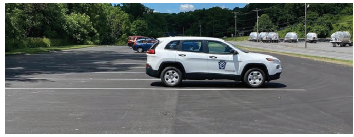
Sandts Eddy Access Area, Northampton County

Sandts Eddy Access Area, Northampton County - The access road and parking lot were repayed to provide safer, more convenient access to anglers and boaters.