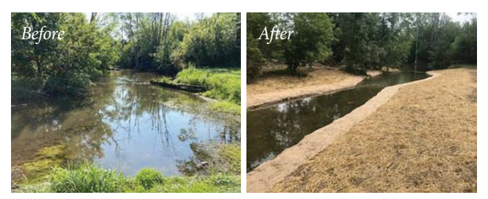
Buffalo Creek, Union County, before and after habitat improvement structures were installed.

The Chesapeake Bay Watershed Habitat Unit completed a project on Buffalo Creek, Union County, during August 2021. Project funding was made possible by the generous contributions of anglers from across the state who purchased a Voluntary Habitat/Waterways Conservation Permit. This project saw its fair share of challenges including two flooding events. One of those was Hurricane Ida, which came the night after the project was completed. In the end, the project restored 600 feet of stream on a "Children's/Handicap Fishing Area." The project consisted of several structures including log frame cross vanes, which create pool habitat to optimize fishing opportunities.