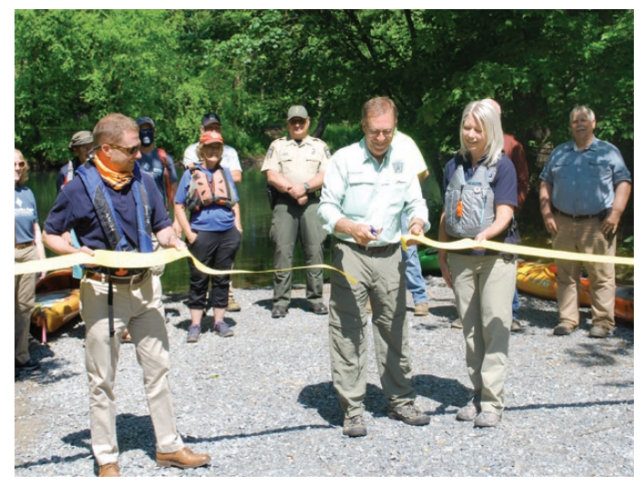
The PFBC held a ribbon-cutting event at Five Locks Access, Berks County.

On May 21, 2021, the PFBC held a ribbon-cutting event at the newly reopened Five Locks Access Area along the Schuylkill River near Hamburg, Berks County. This location provides convenient public access to the Schuylkill River for unpowered boats, such as canoes, kayaks, and paddleboards. The access area had been closed since 2007 due to the discovery of lead contamination in the soil, and a successful lead contamination remediation project occurred.