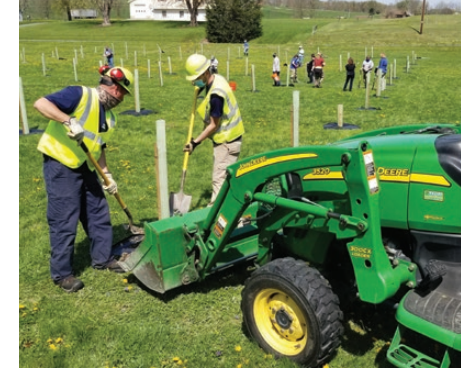
Tree planting along the Juniata River, Juniata County.

Partnership, and Juniata Watershed Alliance, to plant a 7.5-acre streamside forest buffer at the Walker Access in Mifflintown. The addition of these trees will improve the water quality of the Juniata River and eventually the Susquehanna River and Chesapeake Bay.