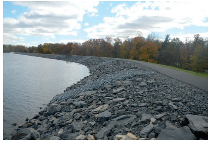
Minsi Lake Dam, Northampton County

Minsi Lake Dam, Northampton County - Pathways constructed of crushed stone were added to the dam for more convenient access for anglers.