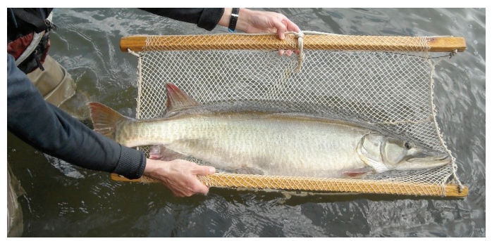
A Muskellunge survey at Canoe Lake, Blair County.

The PFBC's 2021 survey of this 155-acre lake, Blair County, yielded a total of 28 Muskellunge ranging from 27- to 47-inches long. Recent changes in Muskellunge stocking practices, including stocking larger yearling fish every other year, will help maintain a high-quality fishery. As a result, Canoe Lake will be added to the list of Pennsylvania's Best Fishing Waters, offering exceptional fishing opportunities for Muskellunge.