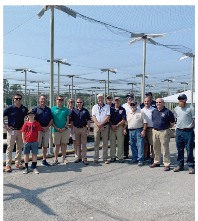
A tour group at the Huntsdale State Fish Hatchery, Cumberland County.

In July, the PFBC hosted members of the Pennsylvania House of Representatives Game and Fisheries Committee for a tour of the Huntsdale State Fish Hatchery near Carlisle, Cumberland County. The Hatchery, which is one of 14 PFBC hatcheries statewide, raises more than 465,000 adult trout each year that contribute to the approximately 3.2 million trout stocked annually in public waterways. During this visit, PFBC staff demonstrated the spawning process of Rainbow Trout, which involves collecting eggs from three-year-old female trout.