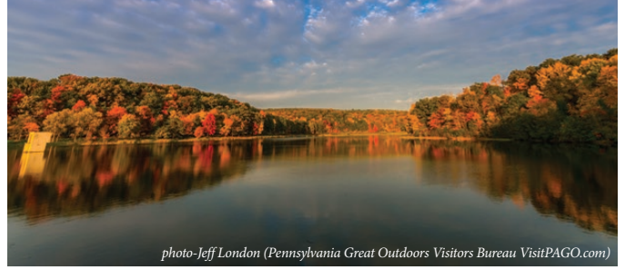
Cloe Lake, Jefferson County

Cloe Lake, Jefferson County – Currently in the early design phase, this $525,000 proposed construction project will address dam embankment drainage deficiencies. Construction is estimated to begin in summer or fall 2025 and be complete in winter 2025.