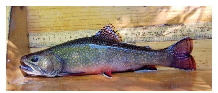
A wild Brook Trout collected during an Unassessed Waters survey.

During 2021, PFBC biologists and Unassessed Waters Initiative partners continued to survey streams to identify and classify naturally reproducing populations of trout. Surveyed waters that support natural reproduction of wild trout qualify to be added to the Commission's listing of wild trout streams and/or listing of Class A wild trout streams. In 2021, the Commission added 78 new waters to the list of wild trout streams and extended the length of 12 waters that were already listed, thus increasing the protection on 208 miles of streams. The Commission added 65 new stream sections to the Class A wild trout streams list, thus increasing the protection on 158 miles of stream.