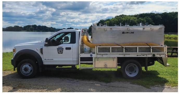
One of the new stocking trucks with insulated aluminum tanks.

Fish Stocking Truck Fleet - Three new stocking trucks with insulated aluminum tanks were placed into service for cool/warmwater fish stocking, and three new hybrid aluminum and fiberglass tanks were added to trucks specifically for trout stocking.