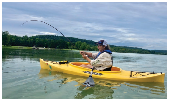
Kayak fishing at Bald Eagle State Park, Centre County.

Throughout the summer, the PFBC conducted in-person and hybrid model education programs in Centre County, including an Intro to Kayak Fishing Program at Bald Eagle State Park; fly casting instruction at the Wildlife For Everyone Great Outdoor Picnic at Penn's Cave; and Women's Intro to Fly Fishing Programs at Fisherman's Paradise and Bald Eagle State Park in partnership with Spring Creek Trout Unlimited (TU).