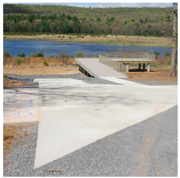
The Americans with Disabilities Act (ADA) accessible pier at Meadow Grounds Lake, Fulton County.

In 2021, the PFBC began, continued, or completed 19 hazardous dam rehabilitation projects across the Commonwealth. The investment in these major infrastructure improvement efforts is part of the estimated $150 million in total rehabilitation needs that was identified at approximately 30 PFBC-operated dams since 2012. Projects can take several years to complete and are subject to a lengthy design, permitting, and construction process. The PFBC works tirelessly to inform the public of the status of these projects through public meetings and the media. The status of each of these projects is outlined in this report by the Commissioner Districts where they are located.