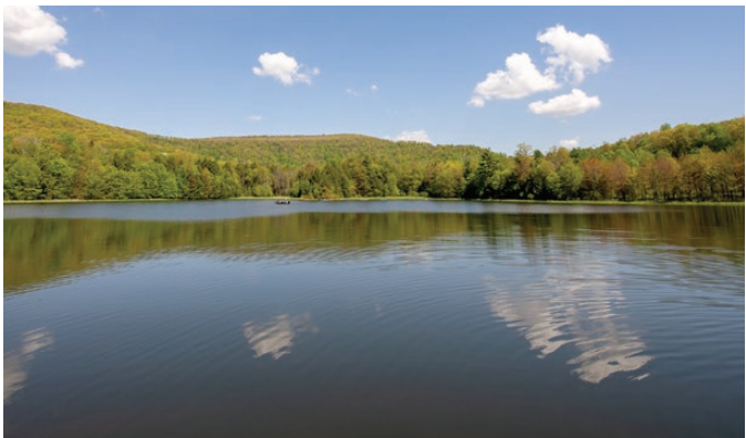
Rose Valley Lake, Lycoming County