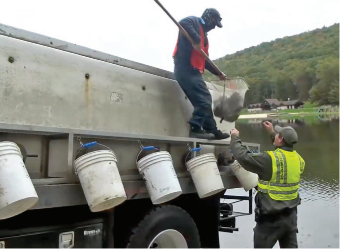
Fall trout stocking at Poe Valley State Park, Centre County.

A fall trout stocking was held at Poe Valley State Park, Centre County. From October through December, the PFBC stocked about 130,000 trout into some of the most popular lakes and creeks, providing a chance to enjoy fishing amid cool temperatures, beautiful fall scenery, and with fewer crowds of competing anglers. The stocked trout will enhance ice fishing opportunities into early 2022.