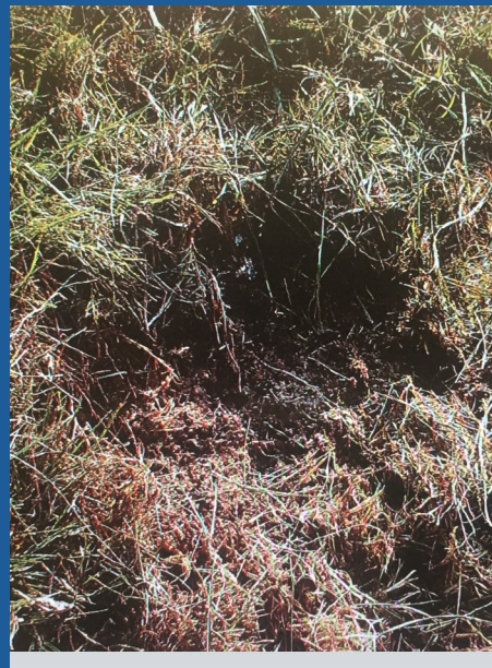
Left: Snapping Turtle. Above: Crater in the ground where the Snapping Turtle exploded. Below: Tires dumped in the Lehigh