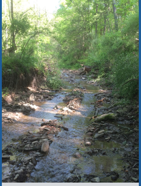
Left: Submerged exploded jet-ski.. Above: Stone removal from King's Creek, Bradford County. Below: Unpermitted excavation work in Roaring Creek, Columbia County and bottom of exploded jet-ski.