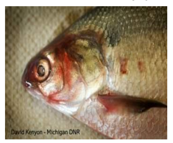
Figure 1. Fish infected with Viral Hemorrhagic Septicemia. (Photo: David Kenyon, MI DNR). and is dependent on water temperature.

hemorrhaging and redness at the base of fins, around the eyes, red patches of skin on or near the head and a swollen abdomen (Figure 1). Internally, the spleen, liver and kidneys may exhibit swelling and/or hemorrhaging. The infection typically results in a disruption of the fish's osmotic balance and affects operation of the swim bladder. In severe cases, death occurs between 2 and 30 days, often preceded by swimming in circles, and a failure to maintain an upright swimming position. VHS is a colder water disease, which affects susceptible fish at water temperatures primarily between the 37 and 54 °F. Hence, it is most often seen in the mid-to-late spring