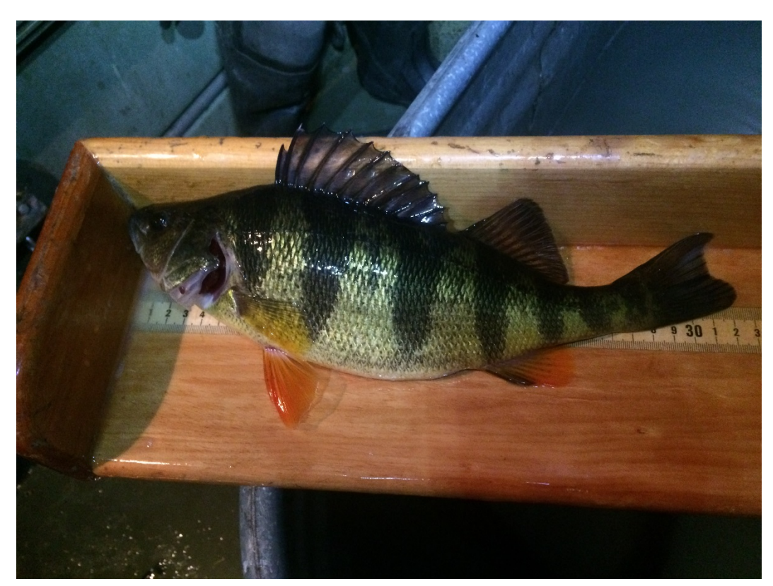
A 12 inch Yellow Perch captured at Rose Valley Lake.