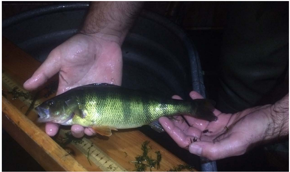
Lake Nessmuk Yellow Perch