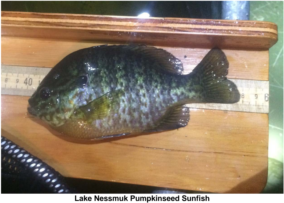
Lake Nessmuk Pumpkinseed Sunfish

Zachary Salada Area 3 Fisheries Biologist Aide