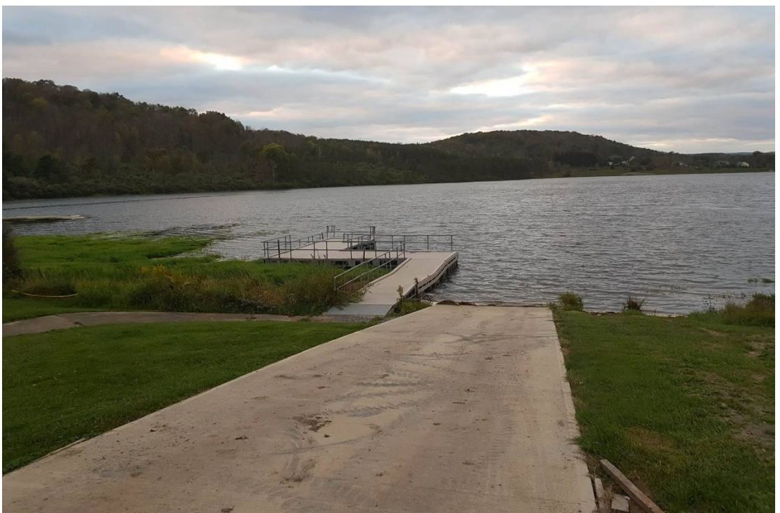
The refurbished boat launch ready for use at Lake Nessmuk