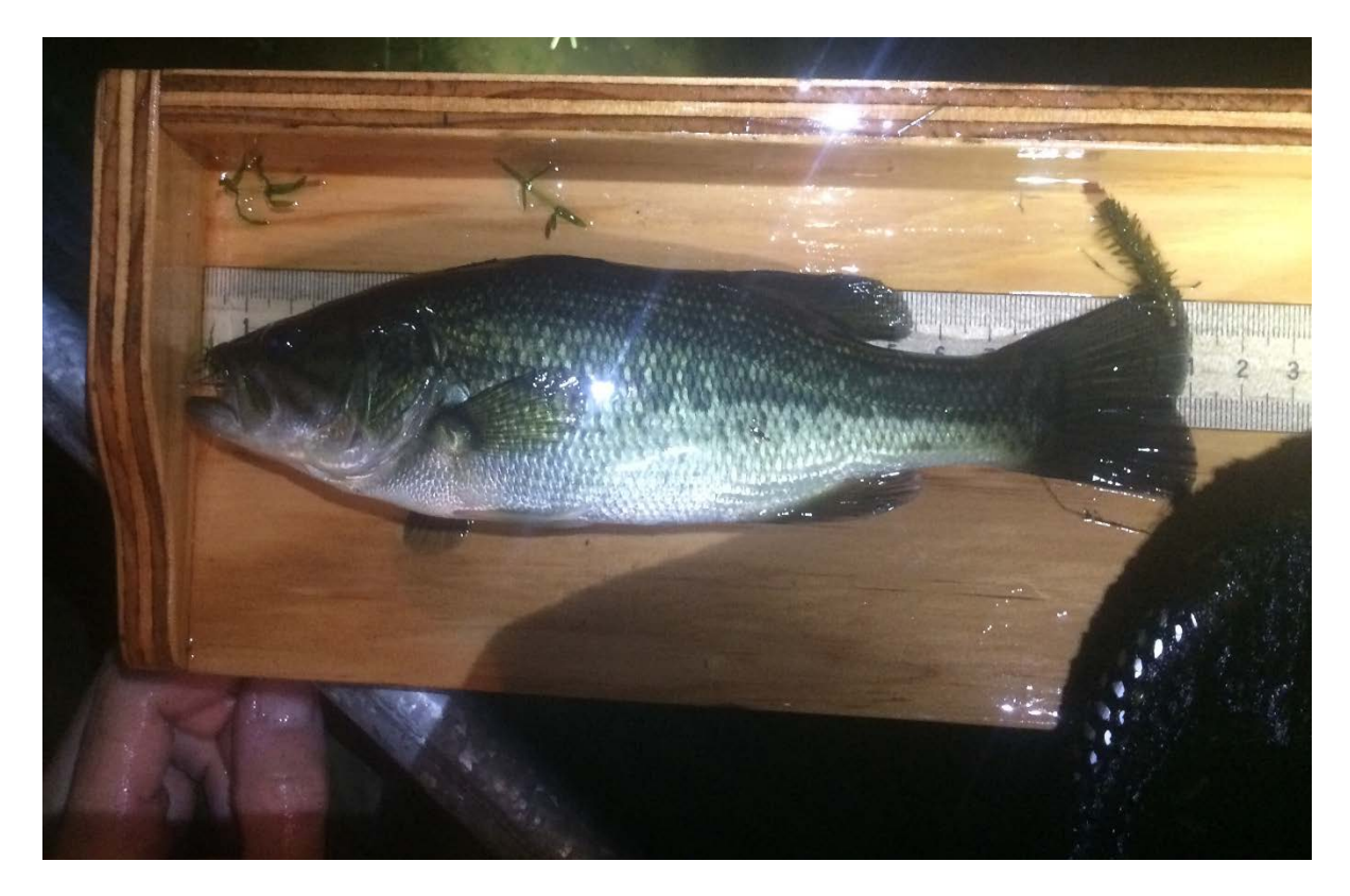
Lake Nessmuk Largemouth Bass