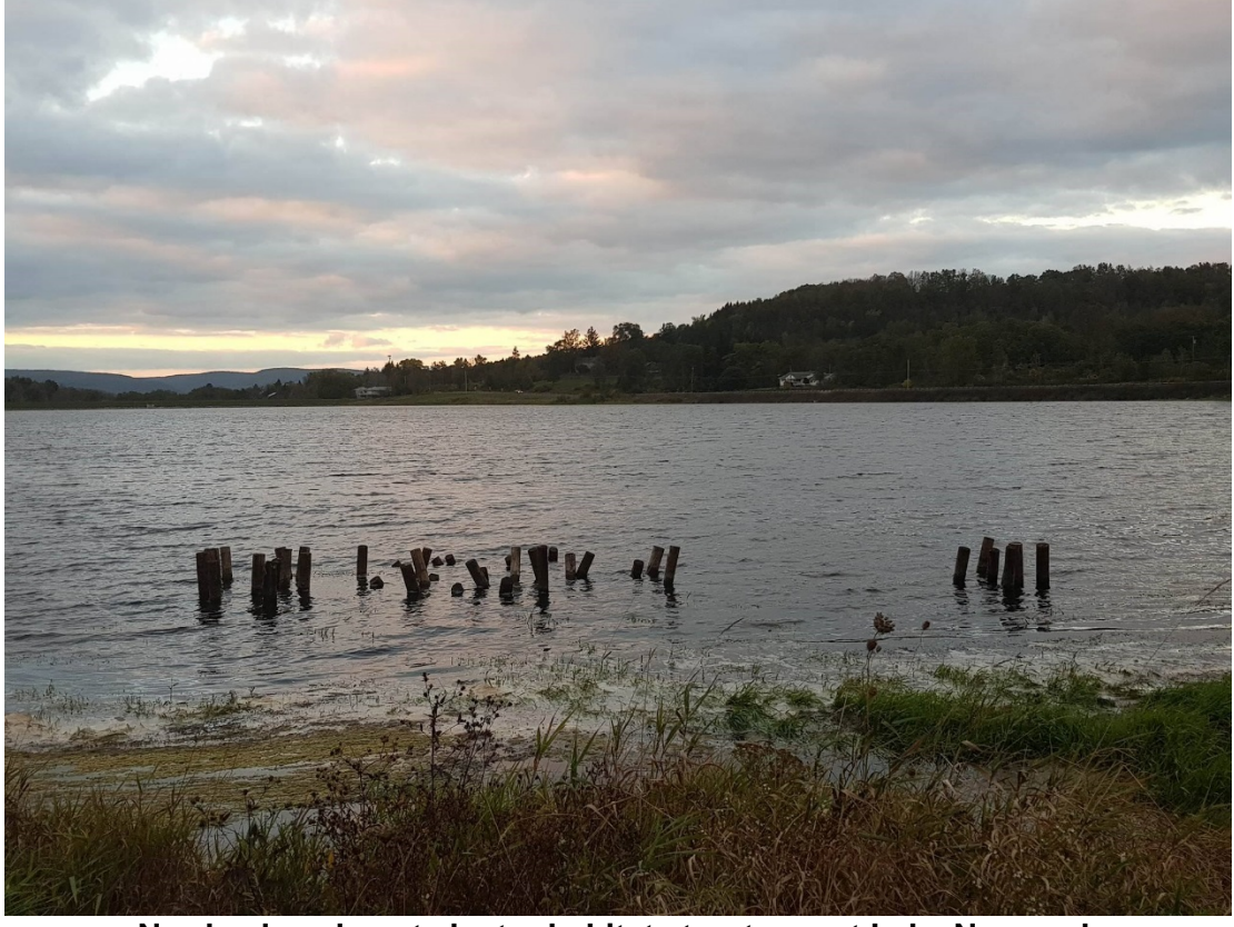
Newly placed post cluster habitat structures at Lake Nessmuk