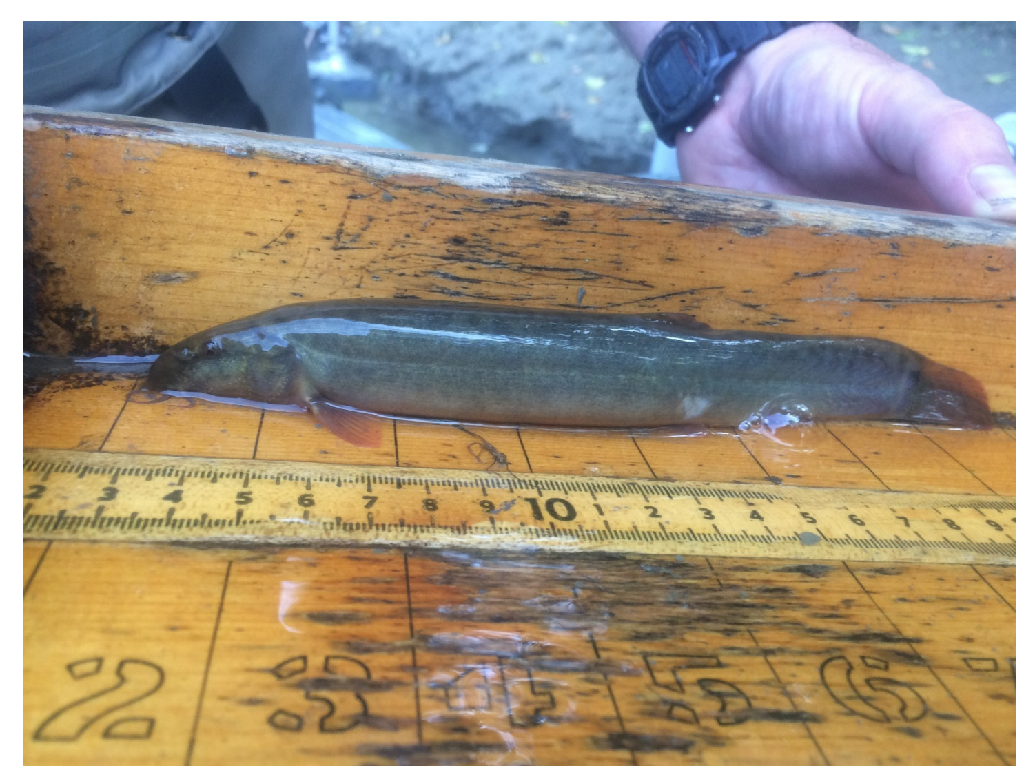
Rob Wnuk Area 4 Fisheries Manager

Figure 3. Oriental Weatherfish captured in the North Branch Susquehanna River in August 2017.