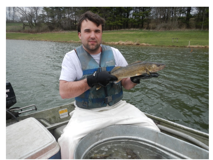
-The only Walleye captured during the 2015 survey was a 20" fish.

Saugeye stocking was discontinued at Dunlap Creek Lake in favor of Walleye management, as Saugeye fingerlings became impossible to acquire due to disease issues. Unfortunately, there appears to be poor survival of walleye fingerlings at Dunlap Creek Lake and a directed fishery has not developed. Only one walleye was captured in trap nets in 2015. Thus Walleye fingerling stocking will be discontinued at Dunlap Creek Lake.