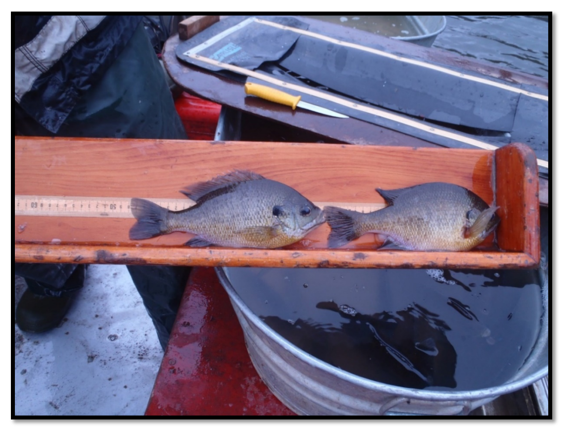
A pair of quality sized Bluegill caught in our trap nets.

Lake Pleasant is well known by anglers who frequent it often as having an outstanding stocked trout fishery. However, what some may not know is the lake also contains a high quality panfish and Largemouth Bass population, for its size. The panfish population increased significantly from our last routine survey. Of the four types of panfish species captured, Bluegill were the most abundant and greatly outnumbered all other panfish by a wide margin. The Bluegill population is providing good numbers (1,131) and size structure with 96% of all fish captured at least 7 inches in length. Many of the fish captured were in the 7 to 10-inch size range. The second most abundant panfish species was Black Crappie at 261 with 76% of these fish greater than 9 inches in length. Other panfish species of interest to anglers included modest numbers of Yellow Perch and Pumpkinseed. Yellow Perch up to 13 inches were also present in our nets and several shore anglers were observed targeting them during our survey. Several quality sized Brown and Yellow Bullhead were also captured in our trap nets.