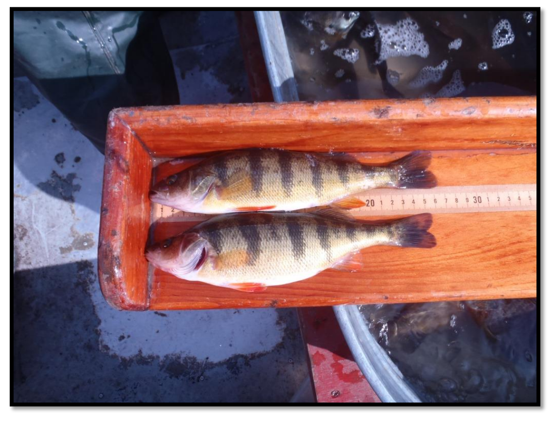
Two post-spawn (male-top, female-bottom) Yellow Perch captured in our trap nets.