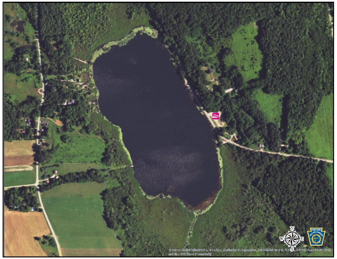
Aerial photo of Lake Pleasant.

Spring 2017 Trap Net and Night Boat Electrofishing Surveys