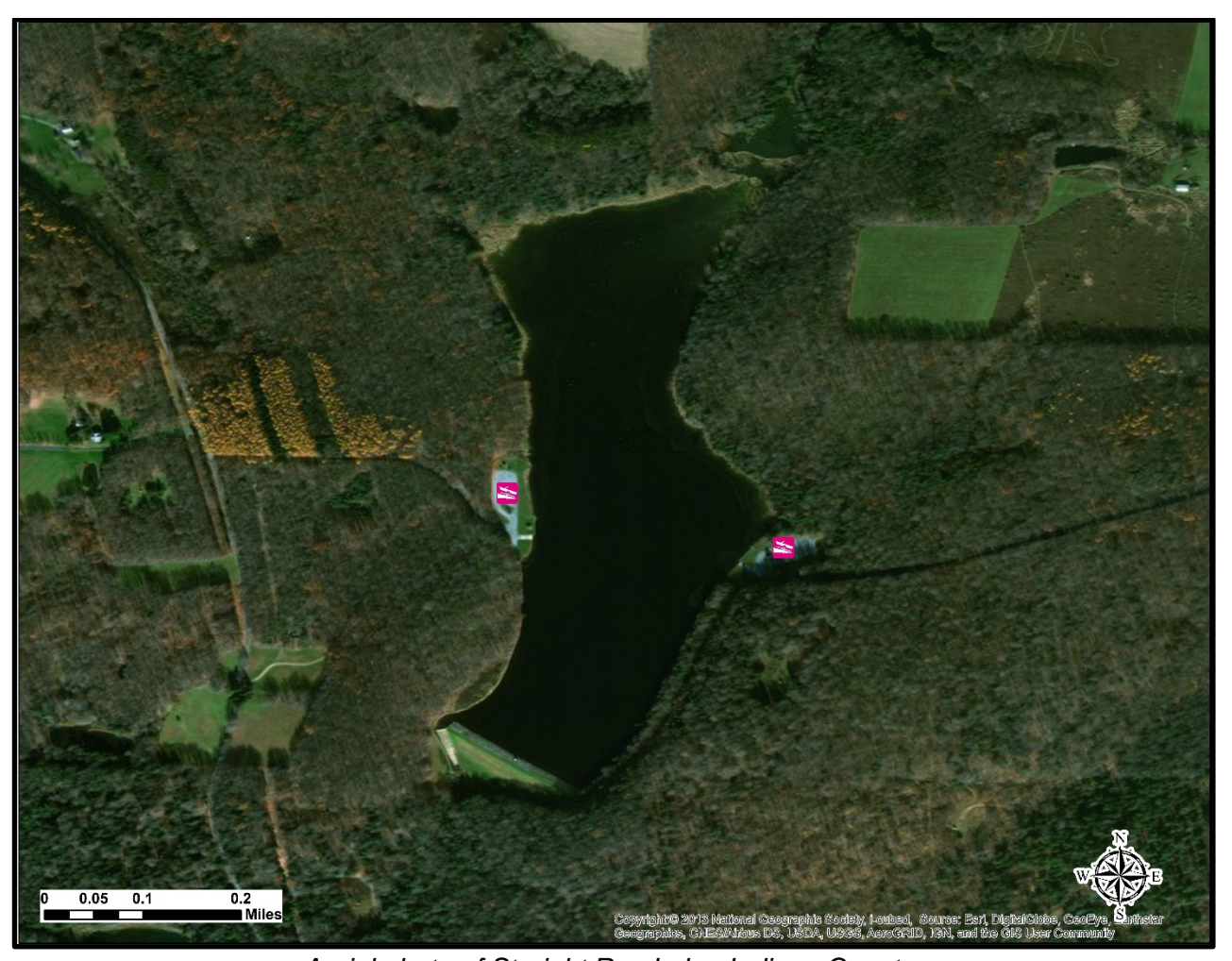
Aerial photo of Straight Run Lake, Indiana County.

May 2018 Night Bass Electrofishing Survey