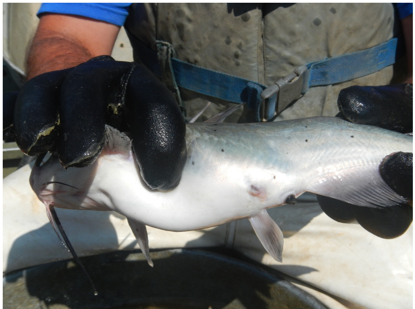
Close-up of a Channel Catfish yearling stocked in 2015 with a left pelvic fin clip.

*Channel Catfish numbers are from trap nets, hoop nets, and night electrofishing