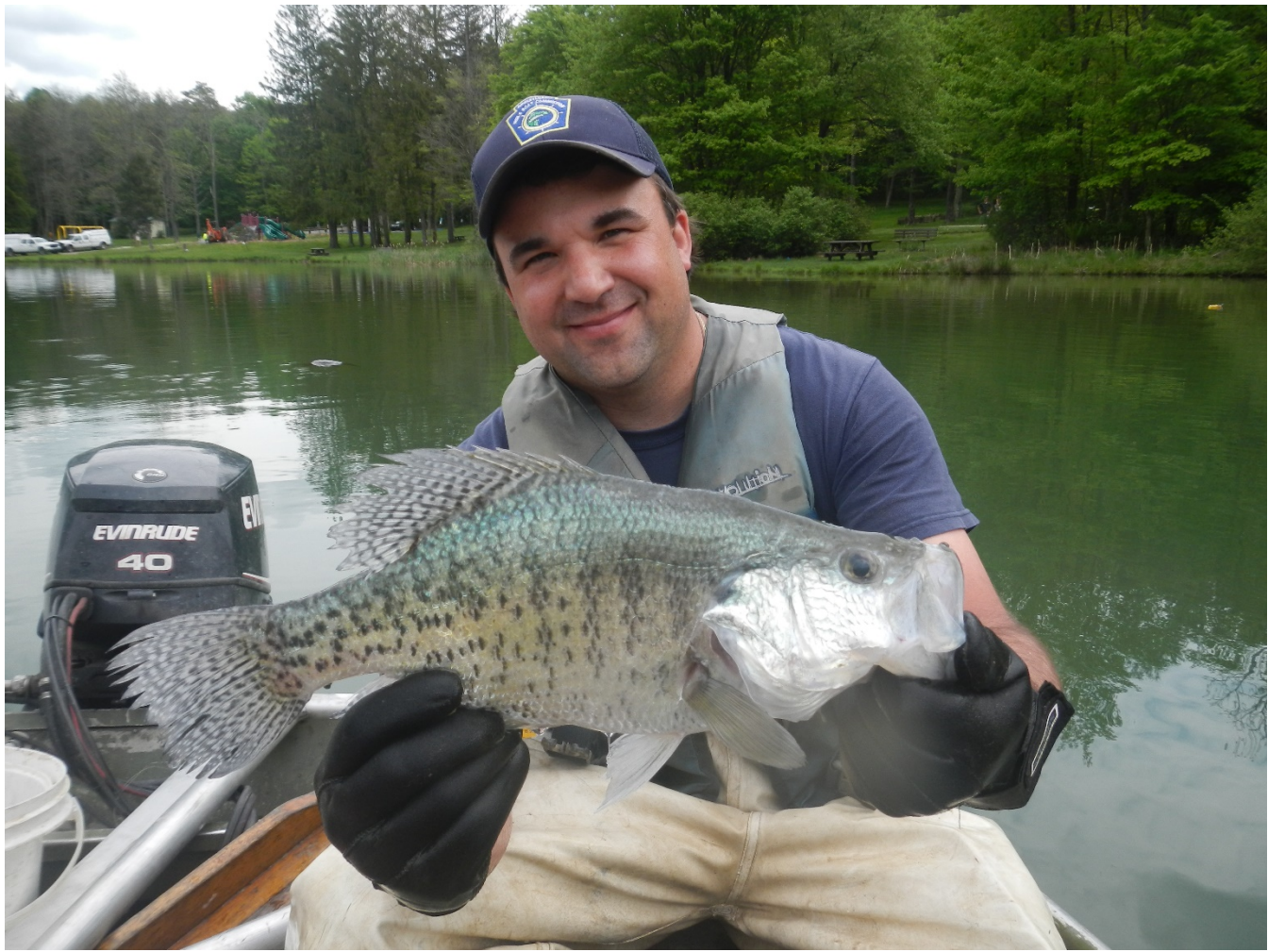
Sixteen inch white crappie captured during trap netting at Upper Twin Lake.