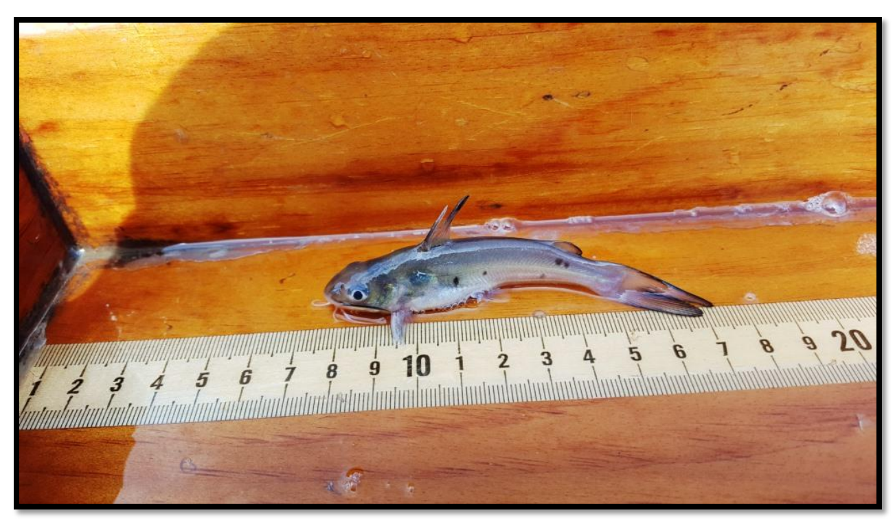
A juvenile Channel Catfish captured in our trap nets in Mahoning Creek Lake.

Other fishing opportunities that are of interest to anglers in addition to Channel Catfish include a variety of panfish species such as White Crappie, Black Crappie and Yellow Perch. The predominant panfish species collected were White Crappie and Black Crappie, both of which were collected in record numbers. Of the 616 White Crappie sampled only 10% were greater than 9 inches. Despite most fish being on the smaller side, we also captured a few quality size individuals up to 16 inches in length. Good numbers of Black Crappie were also present, but again, few individuals were of quality size (≥ 9 inches). The Brown Bullhead and Yellow Bullhead populations continue to provide anglers a nice sustainable recreational fishery.