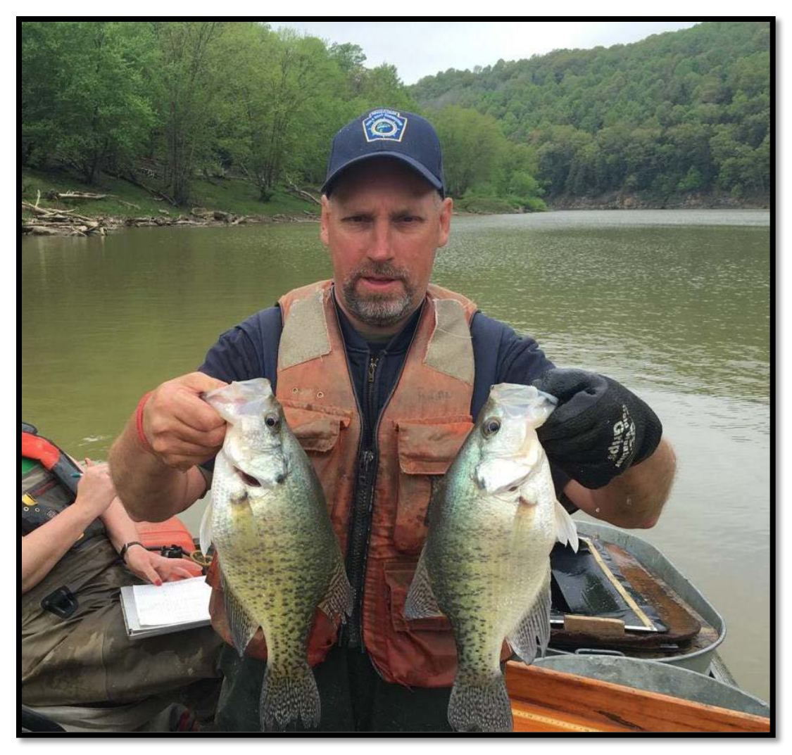
Several quality-sized White Crappie captured in our nets at Mahoning Creek Lake.