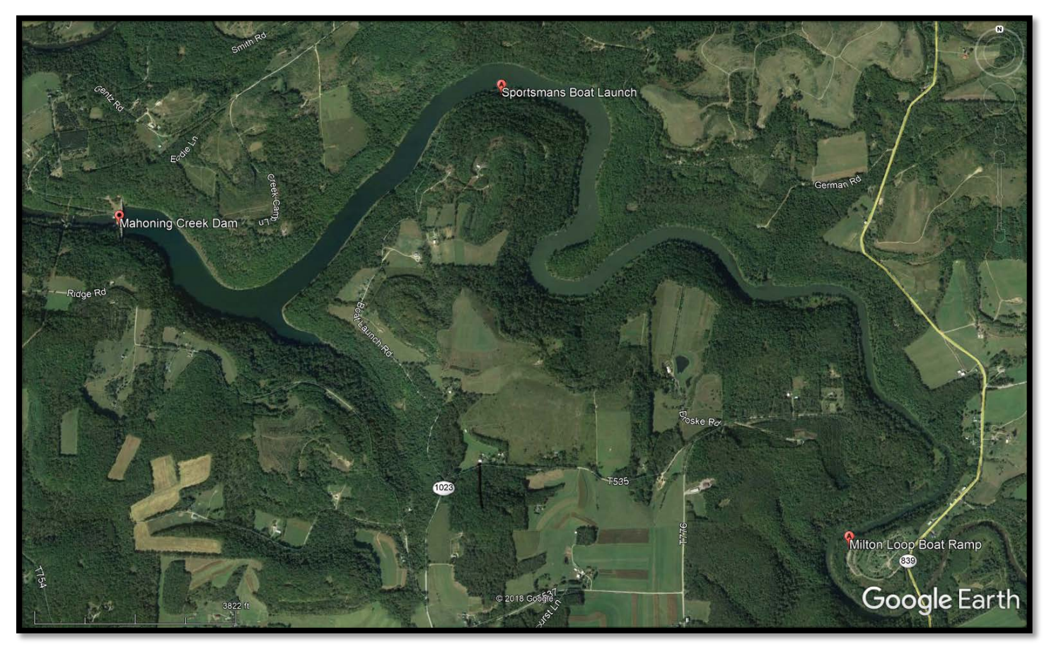
Aerial photo of Mahoning Creek Lake, courtesy of google earth.

Armstrong County Spring 2018 Channel Catfish Survey