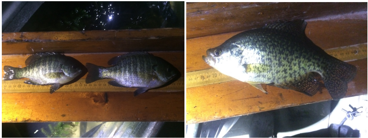
Panfish from Colyer Lake.