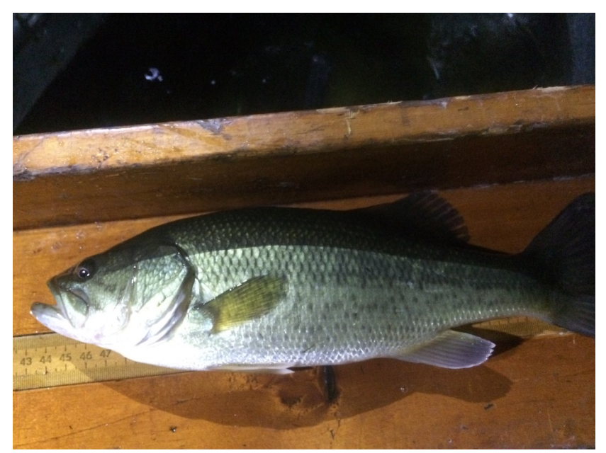
Largemouth Bass from Colyer Lake.