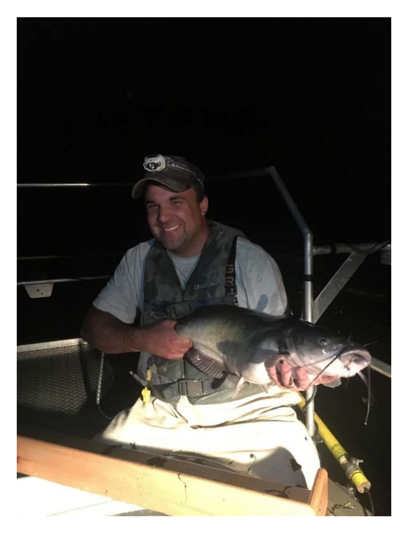
A big Channel Catfish captured electrofishing at Lower Twin Lake