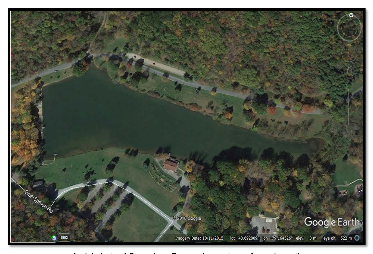
Aerial photo of Cummings Reservoir, courtesy of google earth.

May 2019 Night Electrofishing Bass & Panfish Survey