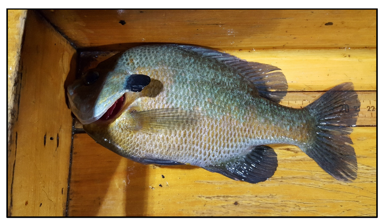
Figure 3. A Bluegill captured during a night electrofishing survey at Cummings Reservoir.

abundance compared to the other sport fishes; some individuals measured greater than 7 inches in length.