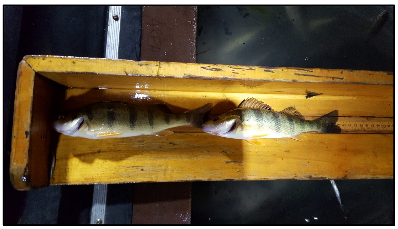
Figure 4. Several Yellow Perch captured during a night electrofishing survey at Cummings Reservoir.