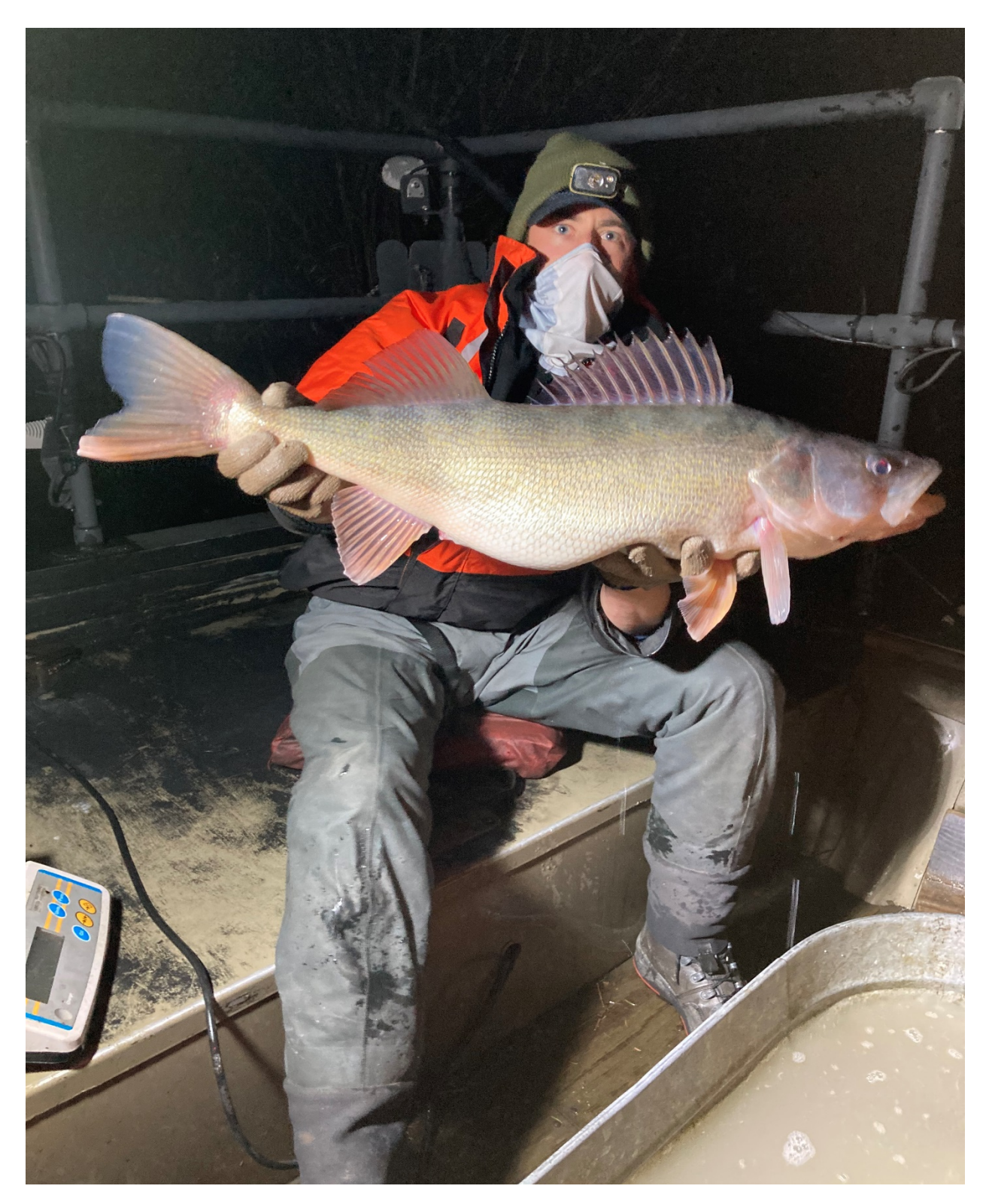
A 28-inch 11.8-pound Walleye captured on March 31, 2021 from Cowanesque Lake.