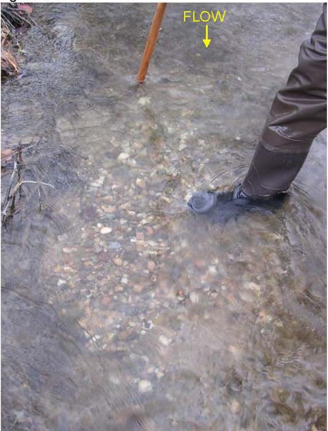
Typical redd showing pit near stick at top and tailspill covering eggs below.

Add trout spawning behavior section with references