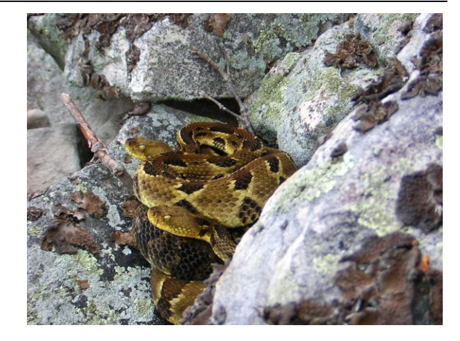
Figure 1. Timber Rattlesnake ( Crotalus horridus ).

<u>Description:</u> The general coloration consists of dark brown or black crossbands on a ground color of sulfur yellow, brown, gray, or black. The crossbands frequently take the