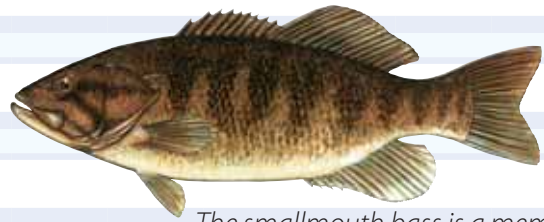
The smallmouth bass is a member of the sunfish family.