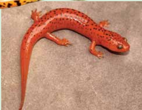
Northern Red Salamander