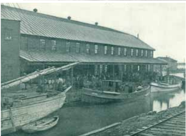
Fishing boats at Erie