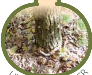
UNDER LEAF LITTER