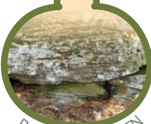
ROCK CREVICE DEN