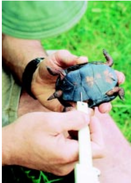
A bog turtle's age can be estimated by counting the annular rings on a plastral (belly) scute.

After considering all of this information, you may be wondering what the average person can do. Involvement in land use and planning decisions at the local level of boro, township, or county can have tremendous effects on the proper use and protection of wetlands and bog turtle habitat. Many communities have embraced their bog turtle