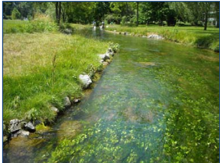
Log-Faced Stone Deflector