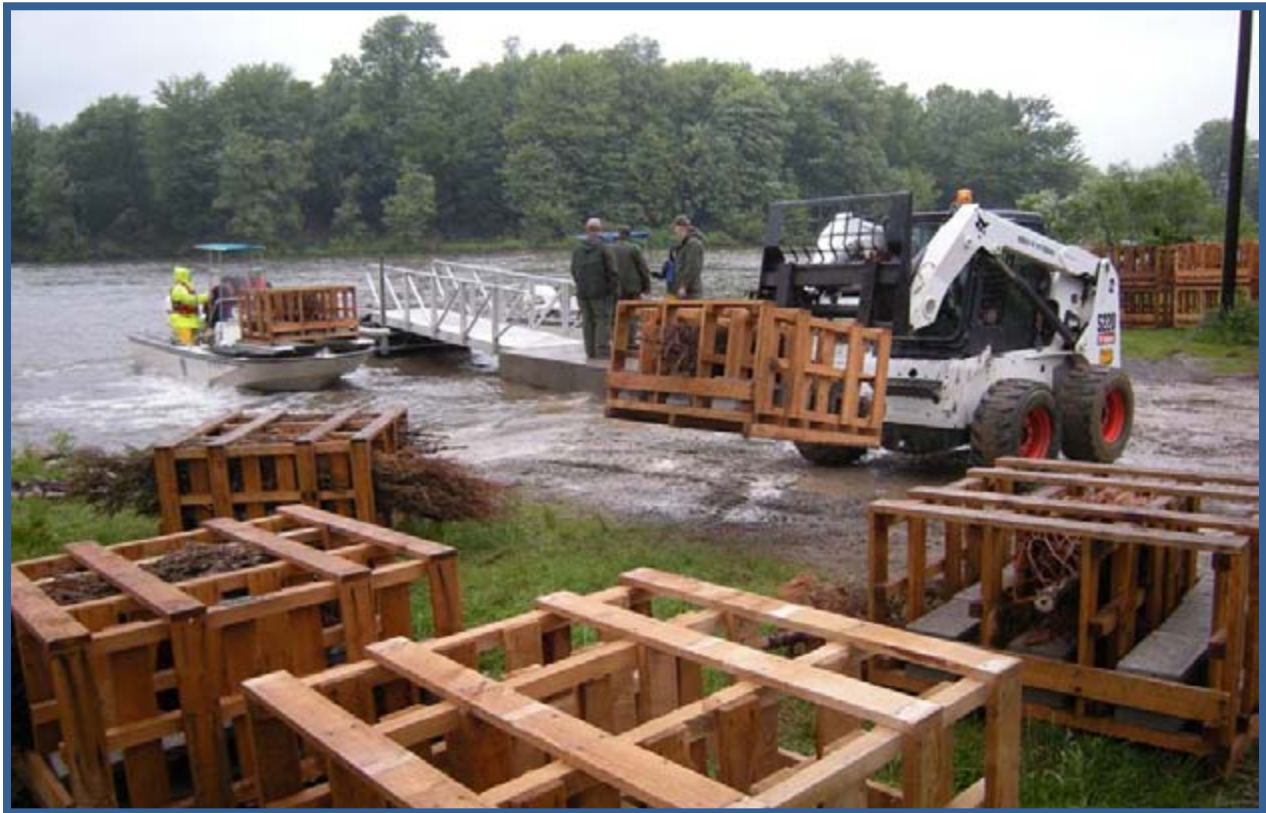
Pymatuning Reservoir, Crawford County received these pre-fabricated Short Vertical Plank Structures as part of the cooperative habitat project between DCNR, Ohio DNR, Pymatuning Lake Association and the PFBC.