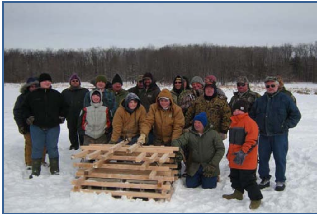
The Mt. Jewett Sportsmen's Club bundled up and enjoyed their first fish habitat project at the Meade Run Ponds in McKean County. The PA Game Commission and the US Forest Service also partnered on the Meade Run Ponds project.