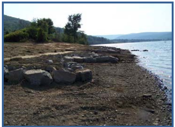
Both Cowanesque (left) and Hammond (right) Lakes in Tioga County had some shoreline erosion issues that were treated with these root wad and stone-framed deflectors. Each lake also received Short Vertical Plank structures as off-shore habitat as part of the cooperative habitat project between the US Army Corps of Engineers, Tioga County Bass Anglers and PFBC.