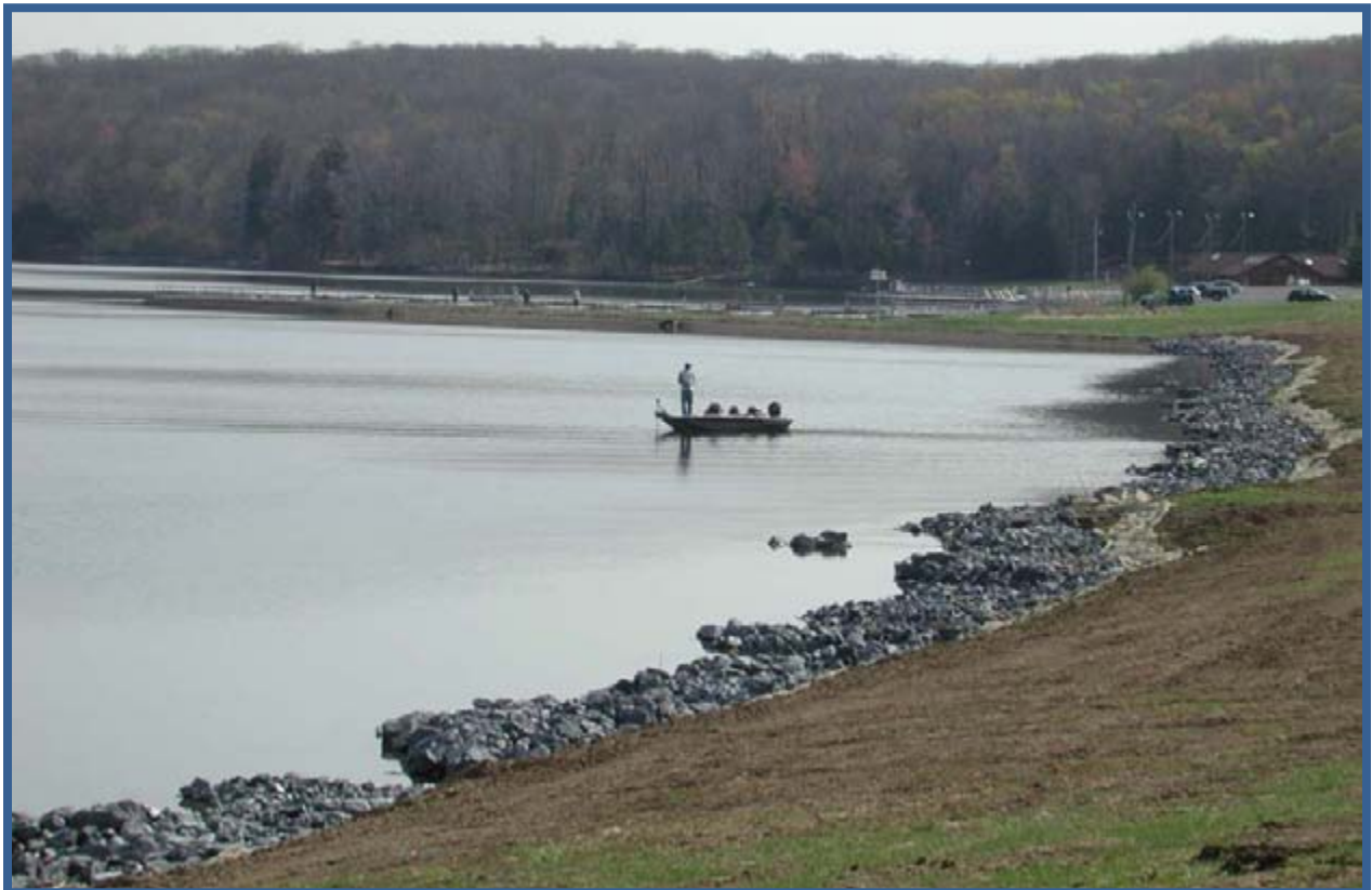
This angler caught some largemouth bass near the newly enhanced shoreline at Glendale Lake, Cambria County... he wouldn't tell us what lure he was using. Growing Greener funding and partners such as Cambria County Conservation District and DCNR/Prince Gallitzin State Park helped to establish this project.