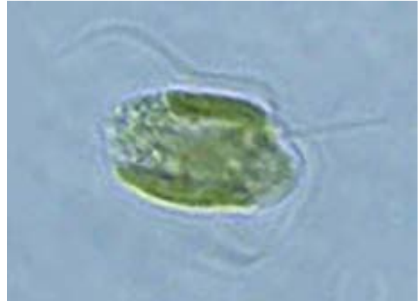
Figure 1. Golden Alga.

Morphology: Each cell has two hair-like flagella used to swim through the water. There is also a shorter stiff hair-like structure called a haptonema, which can be used to attach the cell to other cells or objects. The cell has a C-shaped chloroplast that wraps around the middle and is where the yellow-green color is seen. (Texas 2009a).