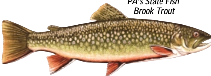
PA's State Fish Brook Trout

PA Fish & Boat Commission web site: www.fish.state.pa.us