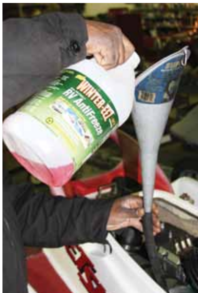
(Right) Recreational vehicle antifreeze should be ran through your PWC before storage for the winter to ensure that there are no cracked or leaking parts due to freezing and thawing water. Make sure to appropriately dispose of antifreeze and any other chemicals that you use when maintaining your PWC.

Operating your personal watercraft (PWC) in the summer can be a lot of fun. As summer progresses, there are many steps that you should take to keep your PWC operating well and to prepare it for storage during the off-season. While there are many different makes and models of PWCs on the market, they all have similar maintenance needs.