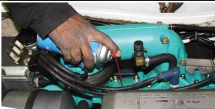
(Above) Use fogging oil to help prevent engine rust and corrosion during storage of your two-stroke PWC. This photo shows applying the oil into a cylinder of a two-stroke PWC after removing the spark plug.