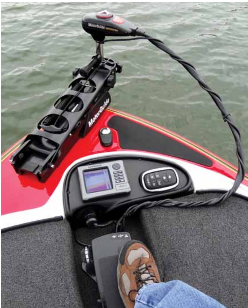
A front mounted trolling motor is a great option for bass boats of any variety. Most bass anglers consider it required equipment. Add an extra depth finder display up front to allow you to check depth and find fish while you operate your trolling motor.