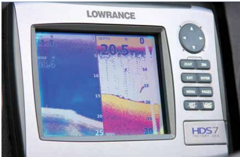
This depth finder offers the ability to show water depth, suspended fish and water temperature. It also has an integrated GPS and mapping capability. On unfamiliar waters, this type of unit will both find fish and help you boat safely.