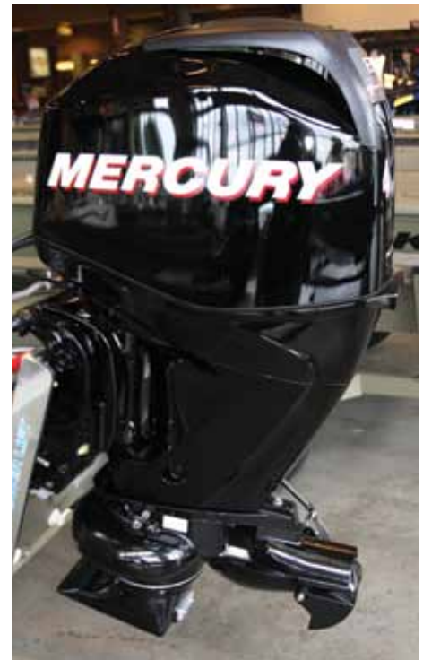
A jet drive motor is useful in many shallow rivers like the Susquehanna, Delaware, Juniata and more. Keep your aluminum bass boat fishing and problem free in rocky situations with a jet.