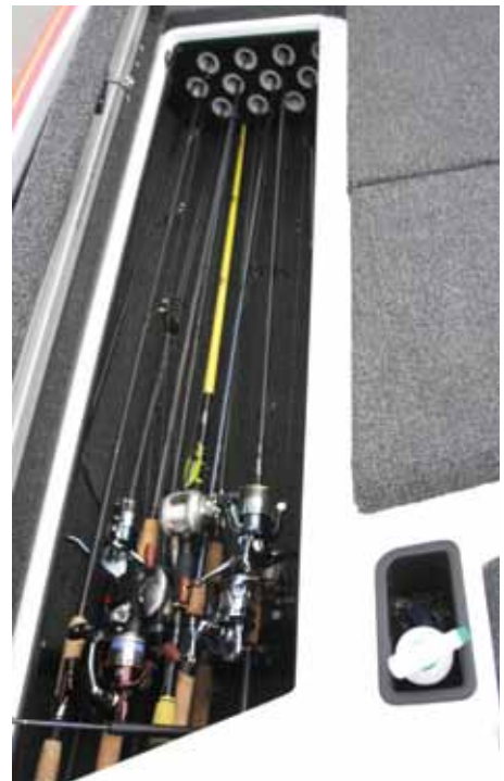
Rod storage is an important component of outfitting your bass boat. Use a closed container to make travel easier, but make sure it can keep the rods separate for easy removal.