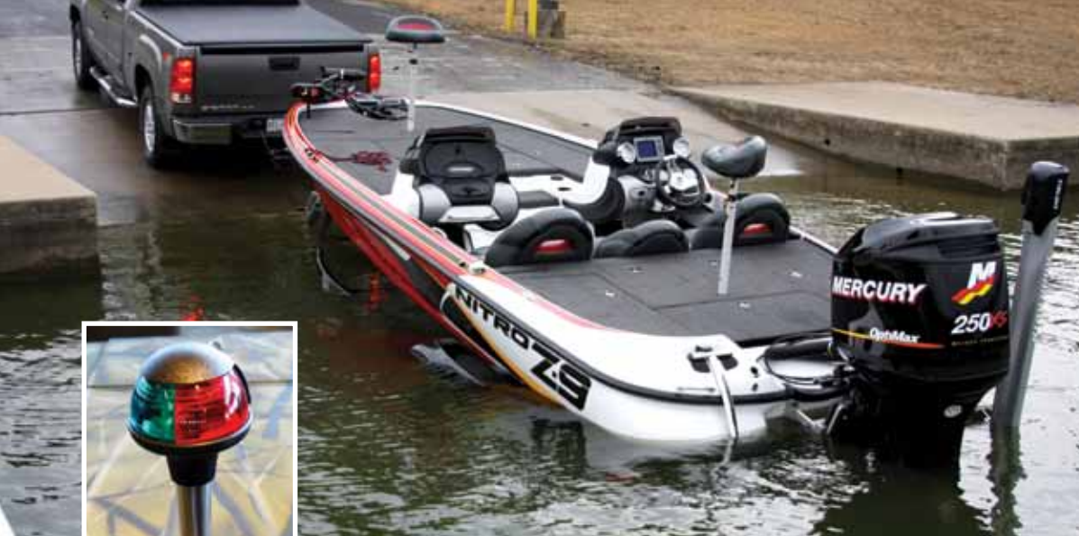
This high-quality fiberglass bass boat has been designed and customized to fish well on large bodies of water like Blue Marsh Lake, which is shown here.