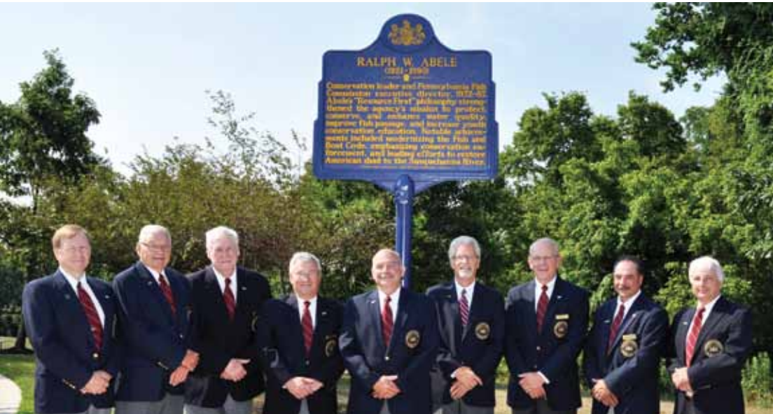
Pennsylvania Fish & Boat Commissioners