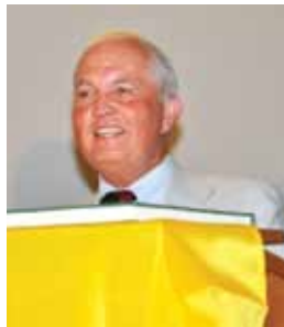
Commissioner Frederick Powell, Pennsylvania Historical and Museum Commission