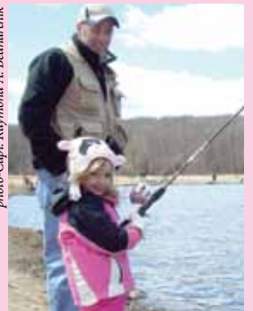
Deep Creek Dam, Montgomery Co.