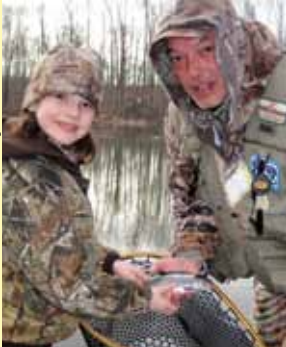
Middletown Reservoir, Dauphin Co.