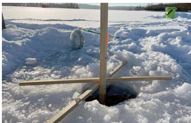
When ice fishing, you only fish the water column under the hole in the ice, so location of the drilled hole is critical.

Angler Ryan Ireland likes to ice fish at Lake Arthur, because the slower pace of ice fishing allows him the opportunity to hit the ice with good friends. Ireland says ice fishing presents anglers with even greater challenges than open water fishing. For starters, you only fish the water column under the hole in the ice, so the location is much more critical. Ice safety is always a priority. Also, the presence of, or lack of, snow on the ice will affect light penetration. When I talked with Ireland, he just finished a “successful but fishless” day. The puzzled look I gave him must have cued him to explain, “Catching fish is great, spending time with your friends is even better.” ☐