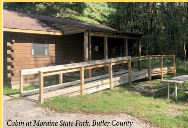
Cabin at Moraine State Park, Butler County