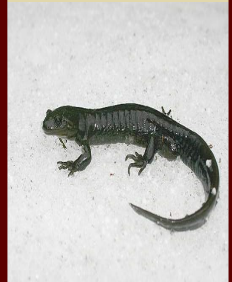
Left: Bucks County Turtles. Above: Tautog fish. Below: Jefferson Salamander and Timber Rattlesnake

Tautog, or Blackfish, is a saltwater species not native to Pennsylvania; however due to a desire to prevent the Commonwealth from becoming a dumping ground for fish illegally caught in neighboring states, there is a minimum size limit of 15" on any such fish imported to or sold within the Commonwealth. Following two tips reporting the possible sale of undersized Tautog at Philadelphia area fish markets a 3 month Covert investigation resulted in charges against the owners of 4 markets and the seizure of over 300 fish. Information developed during this investigation was also provided to PFBC partners in neighboring states where suppliers were identified and charged as well.