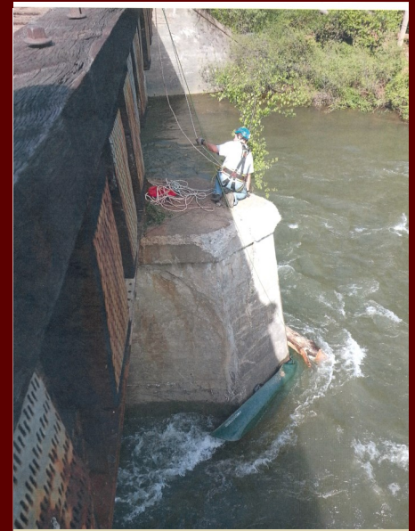
Left: Confiscated drug paraphernalia. Above: Recovery operations. Below: Additional recovery operations, and a Marcellus Shale site.