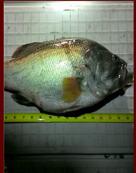
Left: Wreckage of modified Speedboat. Above: 19 inch Largemouth Bass. Below: Largemouth Bass, Snapping Turtle and Painted Turtle.

The most egregious of these were the fishing violations. Bow fishing regulations allow only the taking of carp, catfish and suckers. During the course of these inspections it was discovered that some of these bow fishermen had taken four Largemouth Bass and two Turtles through the use of their bow fishing equipment. Unlike other types of fishing, it is impossible to practice “catch and release” when using a bow. All of the bow fishermen involved in unlawfully taking these fish and turtles were charged with violating 30 Pa. C.S. 2110 (a) Taking or possessing by illegal methods.