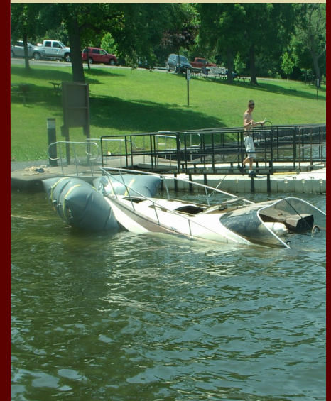
Left: Searching for the sunken vessel at Raystown Lake. Above: Locating the vessel. Below: Vessel at the dock. Confiscated drug paraphernalia.

A waterskiing (prop chop) accident occurred in July on the Conodoguinet Creek in Cumberland County. This incident was unique as the response and subsequent investigation led to four criminal arrests (3 BUI and 1 DUI). The vessel was being co-operated by an underage male and female who managed to run over their downed skier, seriously injuring him. Both operators, as well as the injured skier, were charged with BUI (a shoreline witness was located that provided a statement that the injured waterskier (who was also the boat owner) was observed operating the boat mere minutes before leaving the helm and becoming the skier. On his response to the accident scene, WCO Mark Sweppenhiser affected a vehicle stop of an erratic driver that resulted in a DUI apprehension.