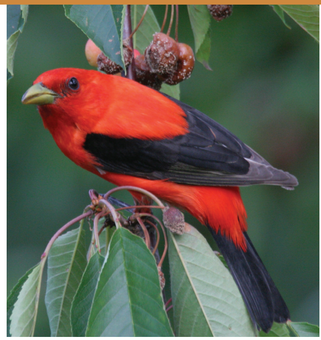
Scarlet Tanager