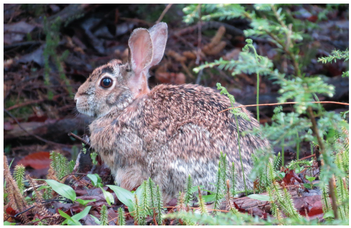
Appalachian Cottontail, D. Gross

New users must register for a free account which will allow them to create and save projects and generate reports. The Quick Start Guide and Help menu will get you started.