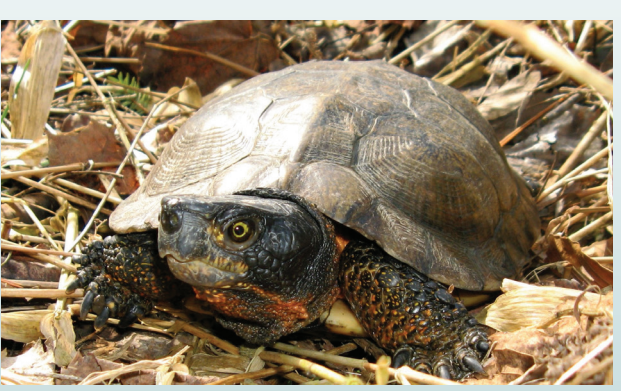
Wood Turtle

The COA Tool expands access to core components and facilitates use of the Pennsylvania Wildlife Action Plan. The Pennsylvania Wildlife Action Plan guides conservation actions to secure Species of Greatest Conservation Need and their habitats and is filled with important information about species, habitats, environmental stressors, needed conservation actions and more.