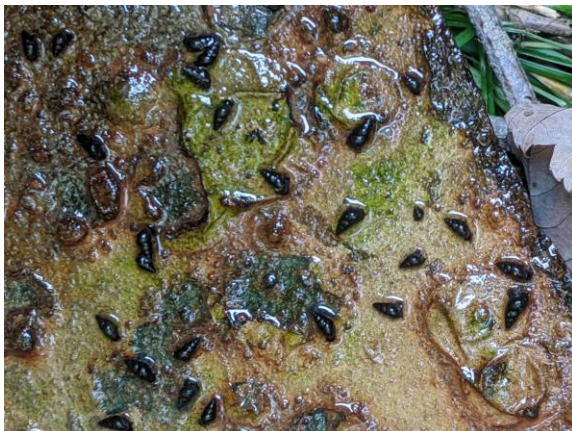
Figure 2. Rock infested with New Zealand Mudsails from Codorus Creek, Pennsylvania.

Notable Characteristics: NZM can achieve high densities within invaded waters (Figure 2); with some extreme estimates suggesting densities of over 299,000 snails per m 2 (Kerans et al. 2005).