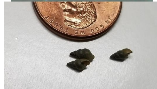
Figure 1. Top: Magnified image of New Zealand Mudsnail. Bottom: New Zealand Mudsnail shells with penny for scale.

Origin: NZM are native to freshwater environments in New Zealand and several surrounding islands. NZM have spread to numerous localities in Australia, Europe, and North America. In the United States, NZM were first reported from near the Snake River, Idaho, in 1987 (Benson et al. 2023).