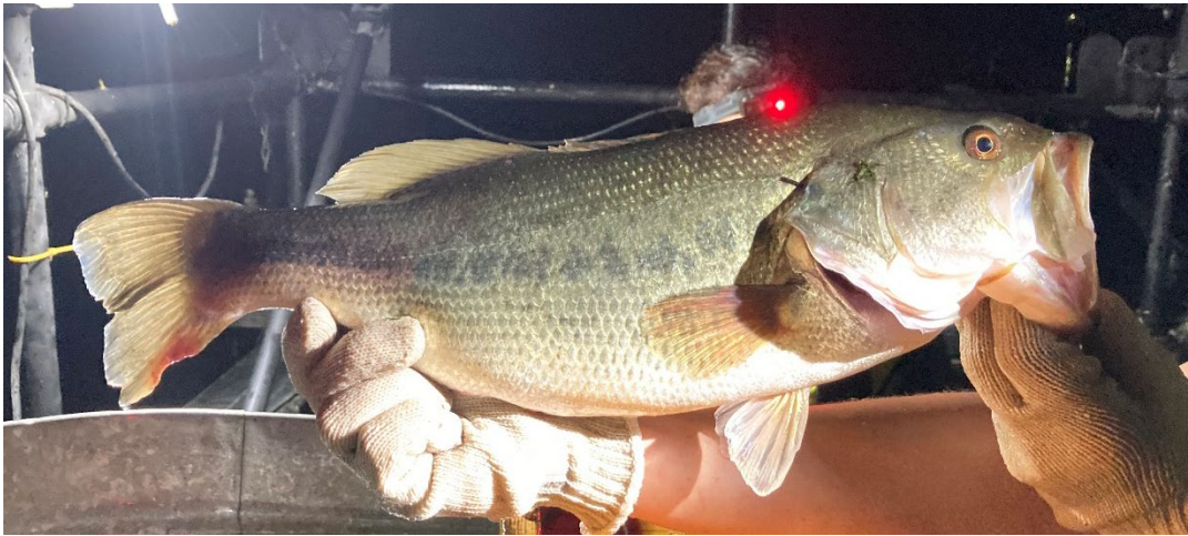
Hammond Lake Largemouth Bass caught June 2021.

Hammond Lake is a 640-acre US Army Corps of Engineers impoundment in Tioga County. The Corps provide many amenities at the lake including boat launches, a swimming area with bathhouse, picnic areas and Ives Run Campground . The Pennsylvania Fish and Boat Commission in cooperation with local groups and the US Army Corps of Engineers have placed numerous habitat structures in Hammond Lake.