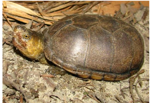
Figure 1. Southeastern Mud Turtle ( Kinosternon subrubrum subrubrum ), Photo credit: Brandon Ruhe.

70-120mm in carapace length (CL), with a maximum CL of 124mm (Conant and Collins 1998). Skin color tends to be olive green or brownish. Yellow markings may be present on the head and occasionally form yellow blotches and lines, particularly around and behind the jaws. The carapace lacks patterning and ranges from yellowish brown, to golden brown, to black. Plastron coloration varies from yellow to brown. The shell is smooth, and annuli wear quickly, particularly on the carapace. The plastron nearly covers the entirety of the ventral surface and contains two transverse hinges, allowing the turtle to cover the limbs and head within the shell when retracted. (from Ruhe and LaDuke 2011).